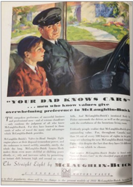
FIG. 2. "YOUR DAD KNOWS CARS," INSIDE COVER, AUGUST 1931 | CANADIAN HOMES & GARDENS

The association of nuclear family units with ideal domestic Canadian life, and thus upon lawns, was also reified in Canadian Homes & Gardens. Illustrations of smiling nuclear families proliferate throughout the magazine. A 1931 McLaughlin-Buick advertisement illustrates a smiling uniformed chauffeur telling a child "your dad knows cars" as the two sit in the driver's seat of an automobile. Behind them, visible from the car window, is the door of a house at the end of a pathway through a green front lawn, suggesting a scene of domesticity from which the child hails—one clearly coded by class status, considering the presence of an employed driver (fig. 2). This advertisement seems to be targeted toward a male automobile buyer—one who could attain a certain appropriately masculine knowledge of vehicles by making rational consumer decisions. It would thus be this man's landscaped front yard that appears in the background, another signifier of idealized class status and domestic propriety. Additionally, advertisements for food, though rare in the magazine, usually depict familial scenes as well: a 1935 advertisement for Chateau Cheese shows a white nuclear family picnicking atop some grass. This image associates their location with adventure and leisure by its suggestion that families take the cheese on "motor trips" or "fishing jaunts." 18 Grass, here, provides an association with fitness and health, and is the backdrop for a scene of family togetherness. In a 1932