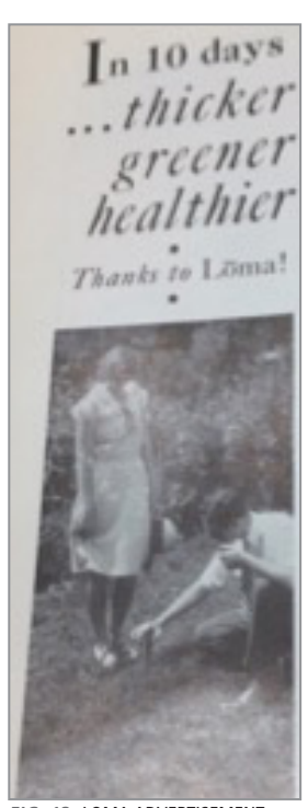
FIG. 12. LOMA ADVERTISEMENT, MAY 1931, P.100 | CANADIAN HOMES & GARDENS