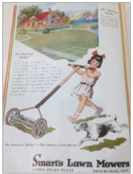
FIG. 10. SMART'S LAWN MOWERS ADVERTISEMENT, APRIL 1932, P.54 | CANADIAN HOMES & GARDENS