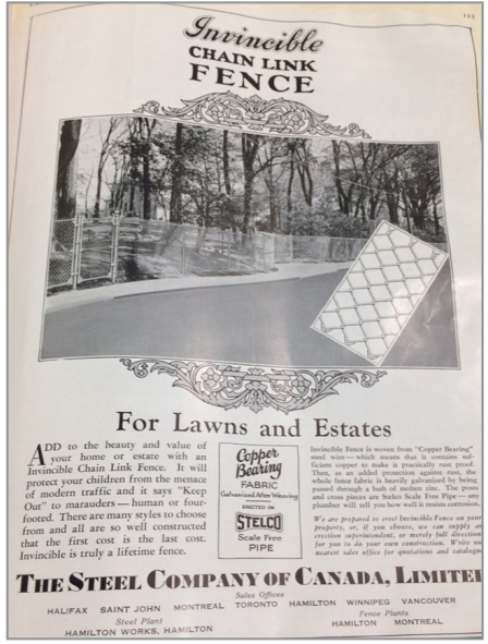
FIG. 7. "INVINCIBLE CHAIN LINK FENCE," THE STEEL COMPANY OF CANADA LIMITED, MARCH 1930, P.115 | CANADIAN HOMES & GARDENS