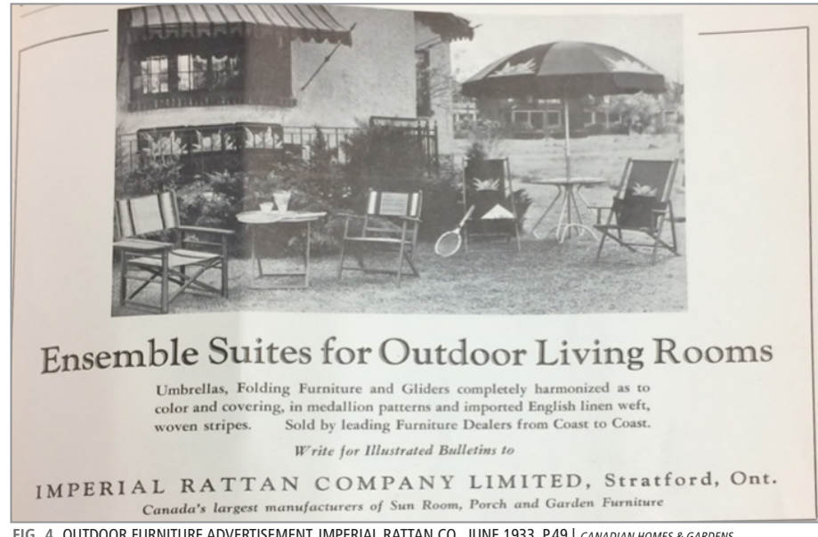
FIG. 4. OUTDOOR FURNITURE ADVERTISEMENT, IMPERIAL RATTAN CO., JUNE 1933, P.49 | CANADIAN HOMES & GARDENS

advertisement from the 1934 June-July issue displays an image of three lawn chairs and a long striped "Glider Couch" facing a central circular table, featuring a pitcher with five drinking glasses and a large lawn umbrella extending through its centre (fig. 5). The circular shadow cast by this umbrella resembles an area rug, on which the legs of the chairs and couch rest. The advertisement tells consumers to invest in "comfortable, cool, restful furniture" in "dramatic, arresting colors" for their "leisure hours" will occur outside in the summer, "when the family moves to the porch and garden."37