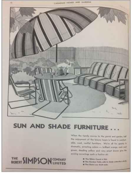
FIG. 5. "SUN AND SHADE FURNITURE..." THE ROBERT SIMPSON COMPANY LIMITED, JUNE-JULY 1934, P.12 | CANADIAN HOMES & GARDENS

authored by women and often referred to their readers as "ladies" or "mothers."<sup>40</sup> By moving the setting for the gendered labour of hospitality and homemaking out of doors, the space of the lawn was made into women's domain along with the kitchen and the dining room.