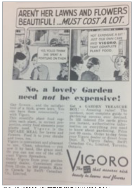
FIG. 15.VIGORO ADVERTISEMENT, MAY 1934, P.64 | CANADIAN HOMES & GARDENS