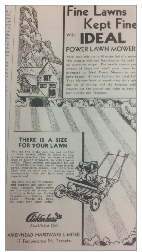
FIG. 6. IDEAL POWER LAWN MOWERS ADVERTISEMENT, MAY 1935, P. 77 | CANADIAN HOMES & GARDENS

Much of the language invoked around suburban gardens aligned the lawn with the interior of the house. Alessandra Ponte notes that gardens, and thus the lawns that covered their "floor," were often described "in terms of interior decoration" for women audiences.41 Lawns had been described using metaphors of rugs, carpets, or velvet long before the 1920s. However, famed nineteenth-century landscapers such as A.J. Downing and Charles Bridgman frequently invoked the imagery of carpets when suggesting that grass should keep a neat and regular appearance, and Henry Cleaveland, writing on domestic maintenance in 1856, suggested that "a carpet before your house" "will infinitely outlive any you can spread within."42