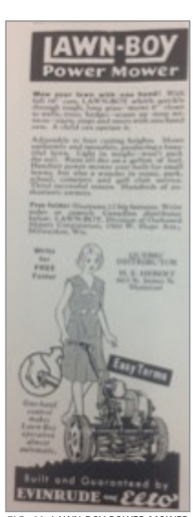
FIG. 11. LAWN-BOY POWER MOWER ADVERTISEMENT, MAY 1934, P.66 | CANADIAN HOMES & GARDENS