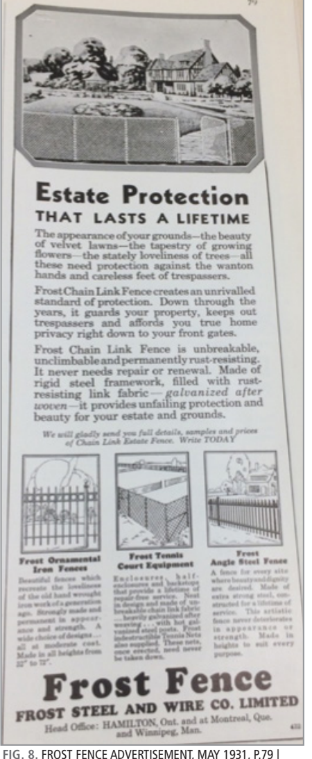
FIG. 8. FROST FENCE ADVERTISEMENT, MAY 1931, P.79 | CANADIAN HOMES & GARDENS

property, manifested by fencing one's yard and confining a lawn to the use of a single-family unit. While lawns, especially front lawns, functioned at least in part as a display of wealth, labour and taste, fences ensured that the public audience