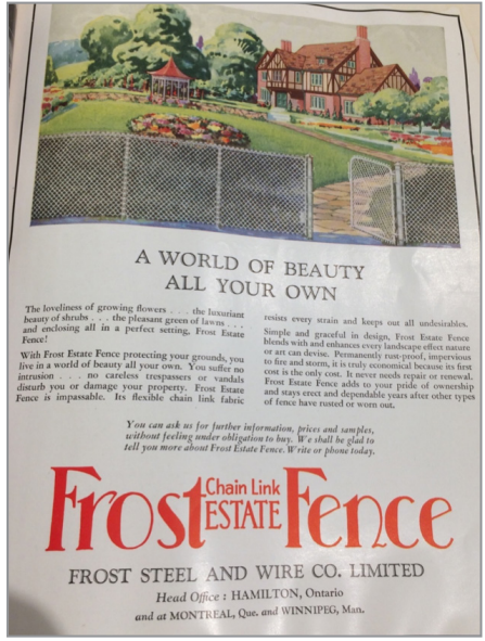
FIG. 9. FROST FENCE ADVERTISEMENT, MAY 1930, P.77 | CANADIAN HOMES & GARDENS

property, manifested by fencing one's yard and confining a lawn to the use of a single-family unit. While lawns, especially front lawns, functioned at least in part as a display of wealth, labour and taste, fences ensured that the public audience