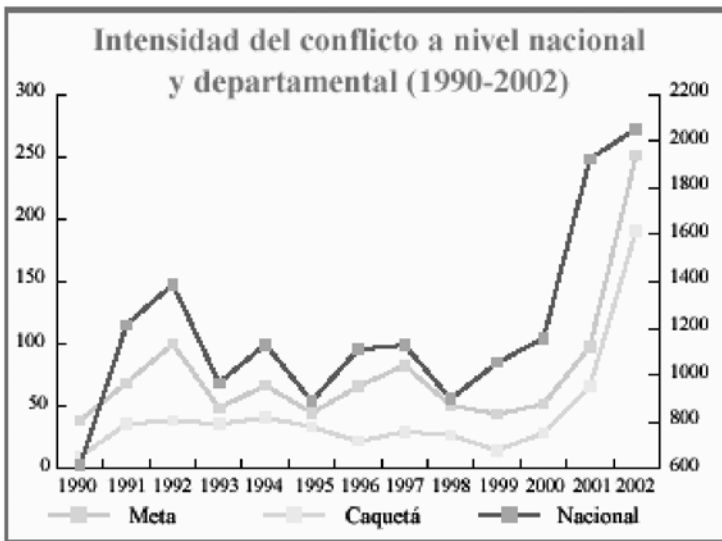
Figure 1. Intensity of the Conflict at the National and Regional Level

Source: Vicepresidencia de la Republica, Informes , 2004.