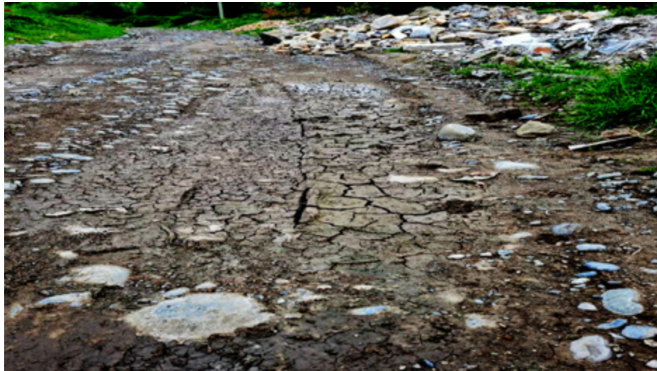
Figure 4. The pond 30 years after the Tavkombalas and the girls played there.

Although the edited story is only one of many possible edits, it helps us imagine how textbooks could be written (or edited) differently to open the timespaces for multiple temporal possibilities beyond the single trajectory of linear, chronological time. It also helps us imagine what might happen if textbooks continue to insist on a universal mastery of linear, chronological time, as if nothing else exists outside of it. In such a spacetime, children would have mastered the rigid schedules and straight timelines so well that they forgot to notice the pond and the Tavkombalas swimming in it. Over time, they would have also failed to notice how the pond was drying up and shrinking. And now, travel-hopping in time 30 years after the “Tavkombala” story, when children pass by the pond on their way to school, their experience is different. The pond is now empty. It has dried up, and there are no Tavkombalas there anymore. The girls do not walk silently along the pond in order not to wake up the fish in the mornings. They are no longer looking forward to playing with the Tavkombalas on the way back from school, and there are no Tavkombalas waiting for the girls to play with them in the afternoons either.