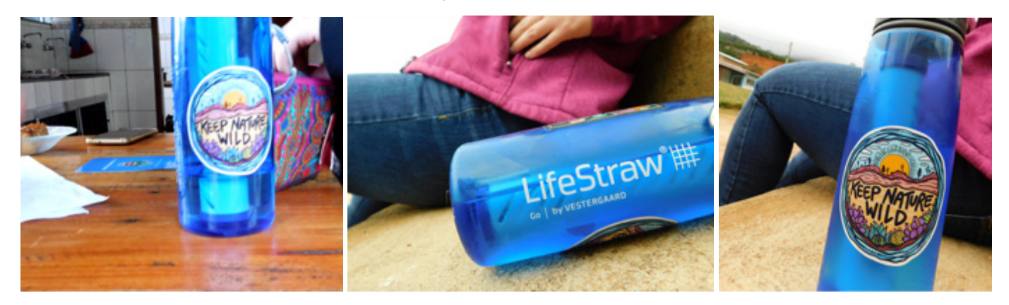
Figure 4. Images of my water bottle, a part of our stories.

A plastic bottle that became a central part of our stories was my reusable blue water bottle with a filter straw. To reduce my need for bottled water, I carried this filter bottle with me everywhere I went. The children loved playing with the bottle. One of the girls in particular would tell everyone around that the straw was a filter, and she would open and close the mouthpiece over and over. A few of the children chose to take pictures of the water bottle and a sticker on it that said "Keep Nature Wild" (Figure 4).