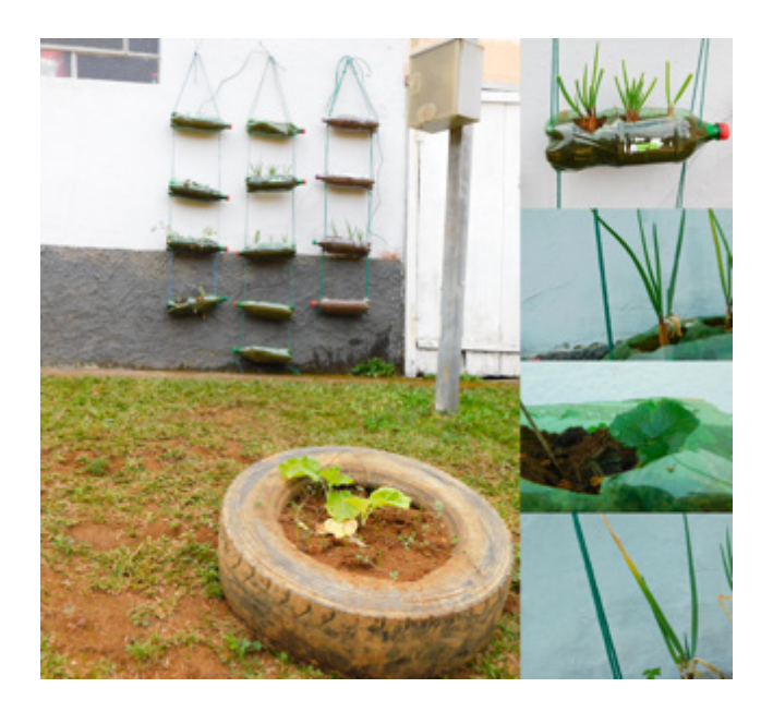
Figure 3. Composite of images taken of a plastic-bottle garden outside the school.

In this composite of photos (Figure 3), as the photographer changes the composition, the plastic is decentered and the focus shifts to the plants. Margaret Somerville (2017), in encounters with children, stones, and water, observed that the children remained silent as they recorded videos of themselves throwing stones into the water. They also framed the video in such a way that only the stones and water were visible, actively decentering themselves (Somerville, 2017). In the case of this story, the plastic bottles in these photographs were not just plastic bottles. They were a vertical garden. They were erased from view.