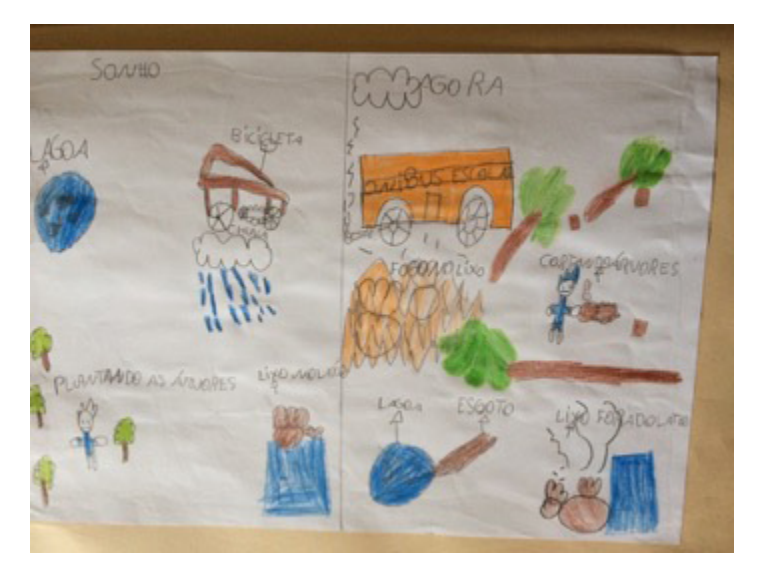
Figure 5. A child's drawing of the world that he sees (right) and the world that he dreams (left).

The children's drawings followed from a conversation they had about pollution in their community river and the act of burning trees to clear land. In Figure 5, a 10-year-old boy drew that agora (now) he sees a school bus spewing exhaust, a person cutting trees, garbage fires, the sewer leading into the pond, and garbage outside the garbage can. In the world that he dreams ( sonho ), on the left side, he drew a pond full of fish, a bicycle, rain, a person planting trees, and garbage in the garbage can. While there is a performative nature to these drawings and they are in direct response to the teacher's prompt, it does not negate the realities of the relationships that the drawings depict. The drawing in Figure 5 was created by the same child who had, prior to this activity, asked to use the camera to take a picture of the destruction of the environment. The other students' drawings were similar in that they mirrored the discussion about pollution and fire. These drawings keep our stories. They are part of the story of Earth's demise. They depict human destruction and a shared hope to live in better harmony with the planet.