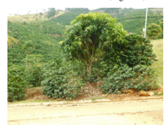
Figure 7. The rest of the world.

The image in Figure 6 shows the school as a narrow grey sliver on the left, the church, which is adjoined to the school, and the grandmother's home/restaurant, which is the purple building on the right. Alongside the wall between the church and the home is a row of wispy plants and succulents. Immediately after taking the photo above, the girl spun around and declared, "Now I will take a picture of the rest of the world," and she photographed the other side of the street (Figure 7).