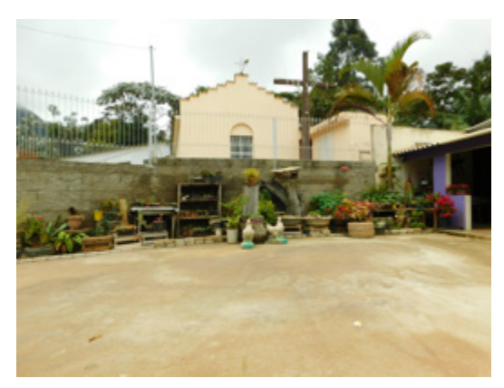
Figure 6. A photograph a child took of her grandmother's home/restaurant, the church, and the school.

Outside of the school activity to draw the world that they see, an 8-year-old girl used the camera to take pictures of everything she saw around her grandmother's home, which is the restaurant next door to the school with the woodfire stove.