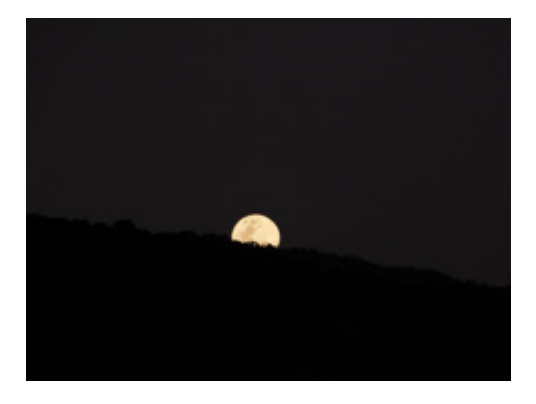
Figure 2. A moonrise over a hill of coffee plants.

The mess of plastic, metal, glass, and batteries that we call a camera became part of our stories. It accompanied us on our walks and in our conversations. We took photos during the day and at night. The children shared the camera and took turns running around what they called "their worlds" capturing images. They took pictures of the cats and chickens. They documented the plants and trees that they themselves had planted. We photographed the sunsets, the school bus driving by, coffee growing on the plants and drying on the ground, the pigs, and a Spiderman sticker on a bike. There was little structure or design to the endeavour. The camera was there for us all. We experimented with the zoom and the flash. We discovered how to record videos. The children took photos that were blurry, and they became part of our stories. They took photos of the flowers, and they were part of our stories in both their physical and photographic presence. One evening, as the moon rose over the hills of coffee plants, one of the teenagers grabbed the camera and photographed it. We passed the camera around and each took a turn trying to photograph the moon, an elusive ball of light in the night sky (Figure 2).