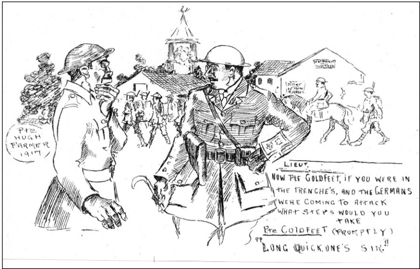
Private Cold feet

“Long quick one’s [sic] sir.” 52 To those not a part of the soldiers’ culture, anti-heroic actions, gallows humour, and biting satire were sometimes misconstrued as soldiers looking to abandon the war effort. Had the army been reduced to cowards? Had rot set in to the once proud fighting forces? While it might have been true for some soldiers close to succumbing to the stress of combat, most understood their role in the war and were not anxious to leave their mates in the lurch. Anti-heroes helped the soldiers deal with the strain engendered by the boredom, banality, and brutality of trench warfare. These cultural figures were also a reflection of inner anxieties and deep-set wishes, which were not always acted upon, but provided a vicarious outlet for many of the expressions and actions prevalent among most soldiers at the front. One should be wary of unifying themes in cultural history; the messiness and inconsistencies of conflicting issues need to be acknowledged and teased out. Soldiers could despise civilians one day and write pining letters to loved ones at home the next; they could turn their nose down at the “eye wash” emanating from ultra-patriotic papers and then turn to those same newspapers to understand what was happening at the front; they could be dodging shells one minute and then, after clearing the wreckage of a trench or helping a bloodied companion to the rear, return to collect the same shell bits as trophies or souvenirs. Heroes could be