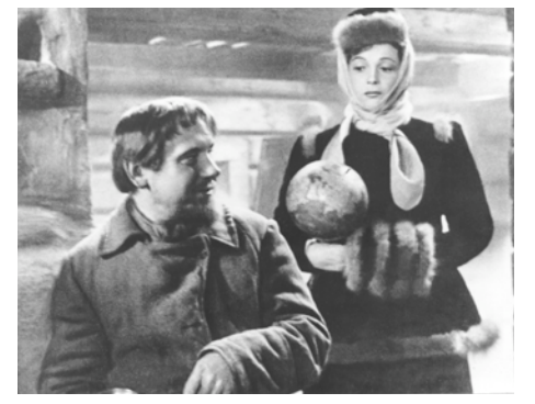
Vera Maretskaia as Varenka in The Village Schoolteacher (1947).