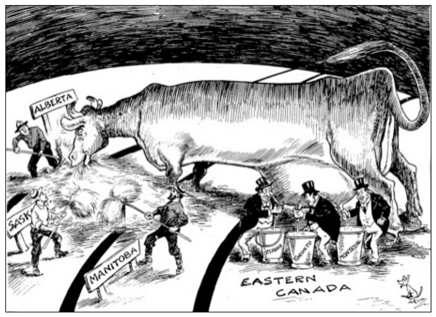
Arch Dale "The Milch Cow" (Grain Growers' Guide 15 Dec. 1915, p. 6)