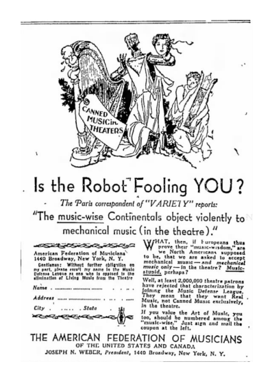
Figure 2.2 American Federation of Musicians, "Is the Robot Fooling You?," Times Herald (Olean, NY), 12 May 1930, 3.