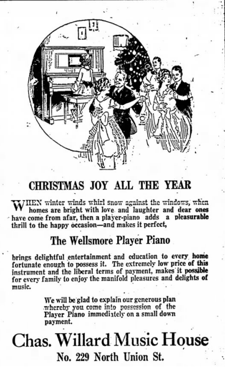
Figure 1.1 "Sale of Players," Evening World (New York, NY), 5 August 1920, 14.