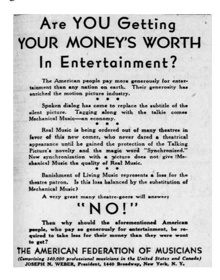
Figure 2.1 American Federation of Musicians, "Are You Getting Your Money's Worth in Entertainment?," Ithaca Journal , 9 December 1929, 9.

alike, and ultimately argued for the importance of "the human touch" (see figures 2.1 and 2.2).