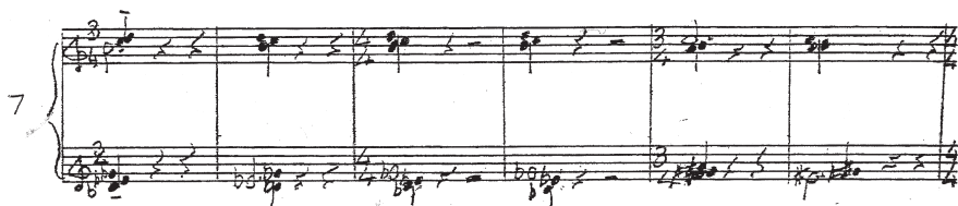
Example 4. Weinzwieg: Shadows, bars 7–12 (with the kind permission of Daniel Weinzwieg)

B-flat while the right hand takes over the E-flat pitch. As the right hand works through eighth-note material that features A-sharp, the enharmonic equivalent of B-flat, this logically leads the listener to the conclusion. There both hands again have triplet sixteenths followed by an eighth-note figure, but the right hand is D + D-flat + C + B-flat, while the left hand has F + F-sharp + G + E-flat, forming a satisfying conclusion. Although some of the pieces lack a large number of dynamic signs, “Reflections” and “Everyday Blues” contain a wide range. As Aitken has pointed out, he gave “dynamics a lot of consideration” (2011, 360). In performance Weinzwieg wanted the dynamic level, and especially the rhythms, to be absolutely precise.