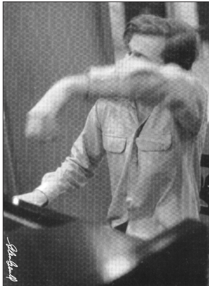
Figure 1. Gould in Columbia Records’ 30th Street Studio in New York, in June 1955, while recording his first Columbia album, Bach’s Goldberg Variations. Glenn Gould magazine 8, no. 2 (Fall 2002): back cover. Unfortunately, no photography was permitted during the Siegfried Idyll recording sessions in 1982.

The only commercial audio recording of Glenn Gould (1932–1982) conducting an ensemble showcased his interpretation of the chamber-orchestra version of Richard Wagner’s Siegfried Idyll (WWV 103). A planned series of studio recordings with Gould conducting other orchestral repertoire never materialized, as he died about two months after the Wagner taping. The one track of his conducting was eventually added to Sony’s reissue on compact disc 1 of a 1973 Columbia LP of Gould performing his own piano transcriptions of orchestral music by Wagner, including the Siegfried Idyll . 2