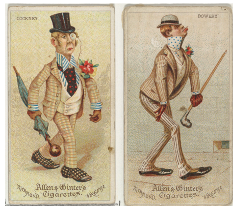
Figure 7: "Cockney" and "Bowery" from World's Dudes series (N31) for Allen & Ginter Cigarettes, 1888, Commercial color lithographs, 7 x 3.8 cm each, The Jefferson R. Burdick Collection, Gift of Jefferson R. Burdick, Metropolitan Museum of Art. http://www.metmuseum.org/art/collection/search/411306 , http://www.metmuseum.org/art/collection/search/411240

like the players he coached, he uses his body as capital. This self-awareness of sartorial performance has a long history: Monica L. Miller identifies it in Black dandyism (219), its roots in the dress of the working classes, diasporic Africans, and sports figures of the early-20 th century. Even earlier than that, the swells, mashers, and dudes of the 19 th century were working-class men who dressed in upper-class styles, often in highly patterned and heavily accessorized suits to attract attention. These men were associated with various disruptions of middle- and upper-class social norms, with their affected clothing, slangy speech, preoccupation with leisure