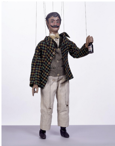
Figure 6: Tiller family marionette company, marionette representing a young 'masher' brandishing a beer bottle, 1870 to 1890, carved wood with paint and fabric, 71 cm, Victoria and Albert Museum. https://collections.vam.ac.uk/item/O57558/marionette-tiller-family-marionette/

like the players he coached, he uses his body as capital. This self-awareness of sartorial performance has a long history: Monica L. Miller identifies it in Black dandyism (219), its roots in the dress of the working classes, diasporic Africans, and sports figures of the early-20 th century. Even earlier than that, the swells, mashers, and dudes of the 19 th century were working-class men who dressed in upper-class styles, often in highly patterned and heavily accessorized suits to attract attention. These men were associated with various disruptions of middle- and upper-class social norms, with their affected clothing, slangy speech, preoccupation with leisure