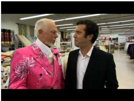
Figure 4: Screenshot from "Making a suit with Don Cherry." YouTube, uploaded by Rick Mercer Report, 18 Nov. 2008, https://www.youtube.com/watch?v=EFpuMzza9hk .

He frequently discusses his outfits on air, pointing out details to the camera. When he does, he highlights them as a costume; they permit him to express his allegiance to particular hockey teams through his choices of colours or logos, or to appeal to "the kids" with cartoon ties. In 2008, he gave fans a comic look into his style process with an appearance on the CBC satirical program Rick Mercer Report (Fig. 4). Cherry took the host through the drapery section at Fabricland, choosing a zebra print. The duo then proceeds to fittings at his tailor, and all the while Cherry signs autographs. In the last scene, Cherry adjusts his tie in a mirrored door, from behind which Mercer emerges wearing a copy of