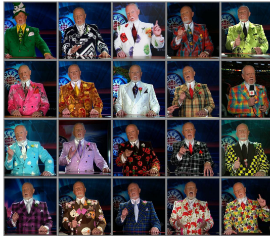
Figure 1: "The many suits of Canadian hockey commentator Don Cherry," Reddit, uploaded by used ihateyourband, 15 Jan 2013, http://imgur.com/gallery/zT2H1

The classic Don Cherry look is readily classifiable. He wears two- or three-piece suits, often in a bright solid or extremely large-scale pattern. His jackets always have very wide shoulders, aggressively angled notched lapels, and can be single-, double-, triple-, or even quadruple-breasted. He accessorizes with pocket squares and a flower in his lapel (usually a rose, in honour of his first wife). Sometimes, he will also add a pin—a Remembrance Day poppy or a Support the Troops gold ribbon. His shirts (only ever worn once) may be white or patterned, but always with very high starched collars (3 ½ inches), the tabs held by a bar, and monogrammed wide cuffs, usually with prominent sports-themed cufflinks. A large wristwatch and heavy diamond ring on his left hand accentuate his gesticulations on screen. He does not wear tie bars, apparently because he often untucks his tie to demonstrate its design on screen: these are sometimes custom-printed for him and feature sayings or animals of which he is fond; alternatively, he also wears ties with sports franchise logos, cartoon characters, or in patterns that match his jackets. These are tied in a single Windsor knot, in a unique reverse method Cherry shares with his idol, hockey legend Bobby Orr (Pearce).