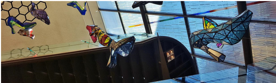
Figure 8 Third Fashion Symposium at the Bata Shoe Museum in Toronto, 2016