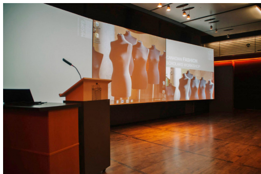
Figure 5 First Fashion Symposium at the McCord Museum in Montreal, 2014

The following year, in November 2015, we reconvened at the Museum of Vancouver for our second annual Fashion Symposium, where I also had the opportunity to curate and organize my first fashion show, entitled Fashion Avant-Garde: Now and Then . This time I collaborated with