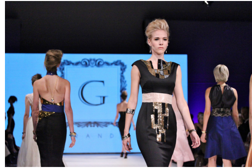
Figures 3 and 4 Montreal Fashion Week 2012, and Vancouver Fashion Week, 2015, photos by K. Sark

itor-in-chief of Imaginations . The third volume was Montréal Chic: A Locational History of Montreal Fashion (2016), which I co-authored with Sara Danièle Bélanger Michaud, a francophone Comparative Literature scholar, who contributed the “Symbols” and “Music” chapters and helped map out the French literature on Montreal fashion. I focused my research on the history of fashion in Montreal, the fashion collections and exhibitions housed at the local museums, the complex fashion economy, the vibrant fashion scene with incredibly talented designers, the intersections of fashion and film, as well as the emerging field and community of fashion and technology based in Montreal. Through this work, I not only gained a better understanding and appreciation of the Canadian fashion landscape but also recognized the need to connect and generate visibility for the tremendous work of others. During my research for this book, I