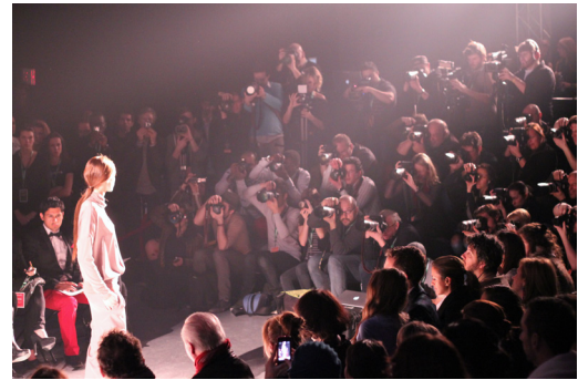
Figures 1 and 2 Colour Block Party at the Montreal Musee des Beaux Arts with designs by local designers, and Montreal Fashion Week 2012

conversations. It is commonly accepted that communities are only as strong as the collective efforts of their individual participants. They require organizational leadership, as well as communal contribution and dedication. Professional and academic associations and organizations usually come together on an annual basis to ex-