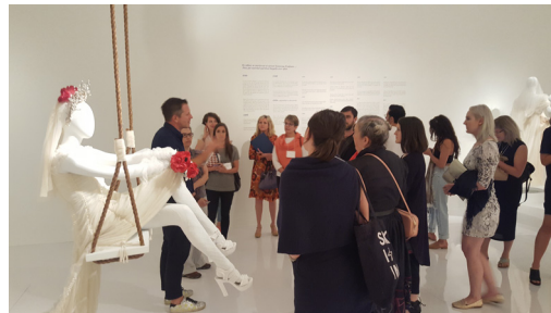
Figures 9 and 10 Fourth Fashion Symposium at the Montreal Musee des Beaux Arts and the tour of the Jean Paul Gaultier Love is Love exhibit with curator Thierry-Maxime Loriot in 2017, photos by K. Sark