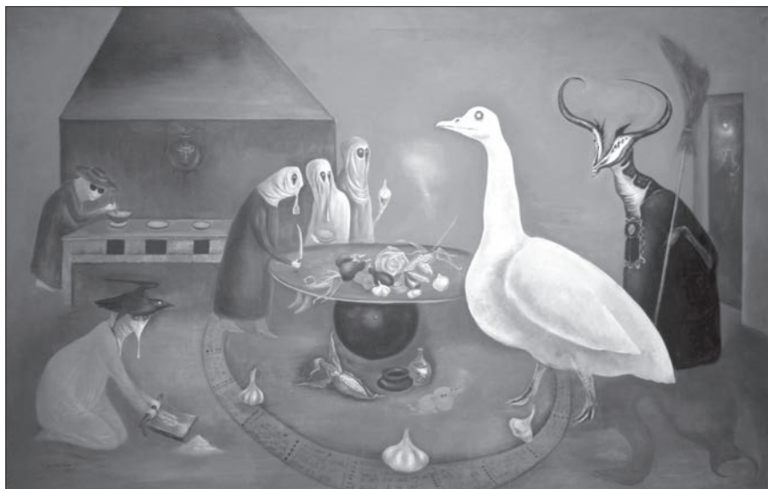
Fig. 3: Leonora Carrington, Grandmother Moorhead's Aromatic Kitchen, 1975, oil on canvas, 79 x 124.5cm, Charles B. Goddard Center, Ardmore, Oklahoma, USA.