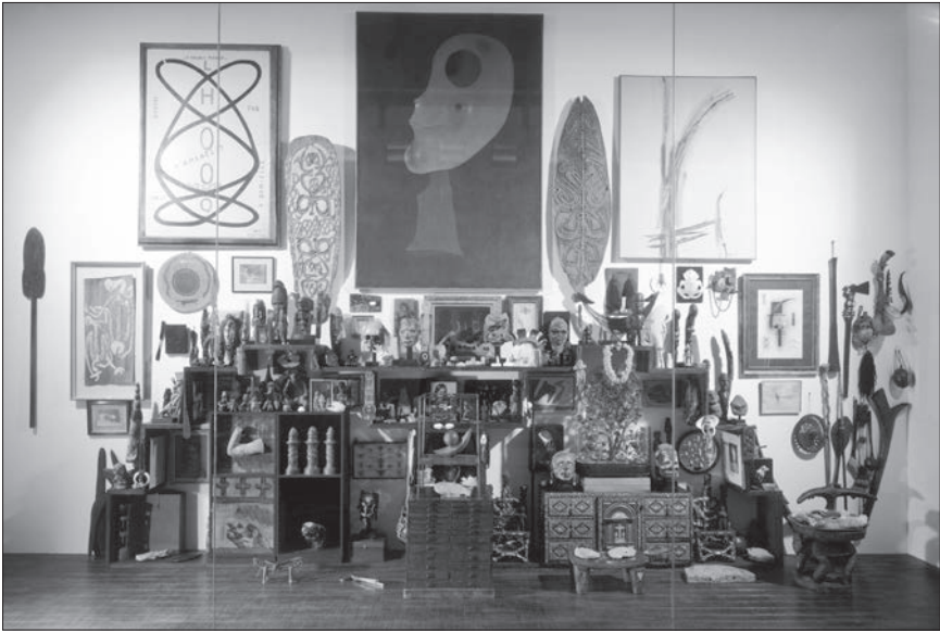
Fig. 2: Reconstruction of the wall of André Breton's studio on rue Fontaine, Paris. Musée National d'Art Moderne, Centre Georges Pompidou, Paris. Paintings by Miro, Picabia, Giacometti: © Artists Rights Society (ARS), New York.

indexed and photographed. 22 This recategorization—with its definitive separation of primitive from modern, high art from popular art, painting from text—does more to dissolve the studio's archival, or meta-archival, function than even the sale itself.