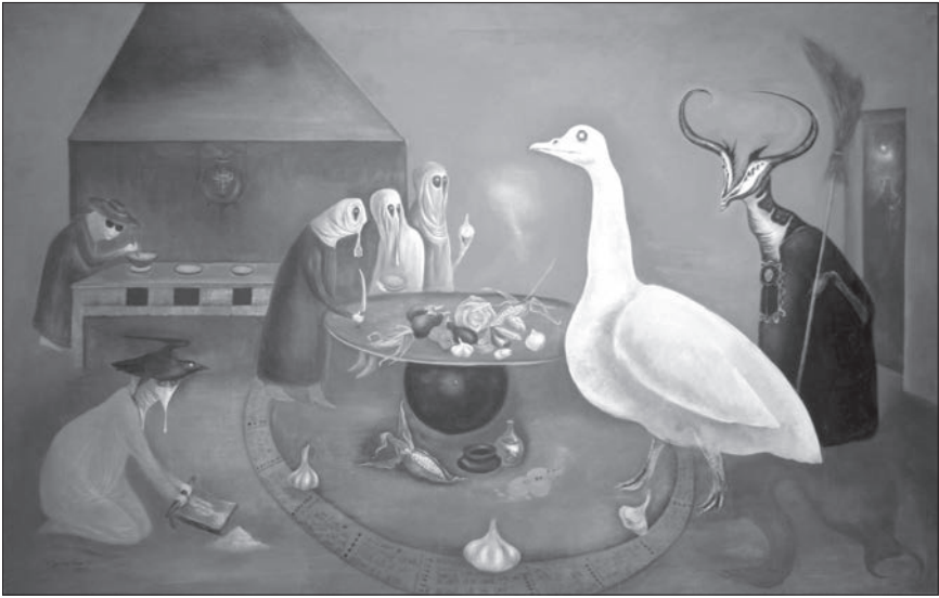
Fig. 3: Leonora Carrington, Grandmother Moorhead's Aromatic Kitchen, 1975, oil on canvas, 79 x 124.5cm, Charles B. Goddard Center, Ardmore, Oklahoma, USA.