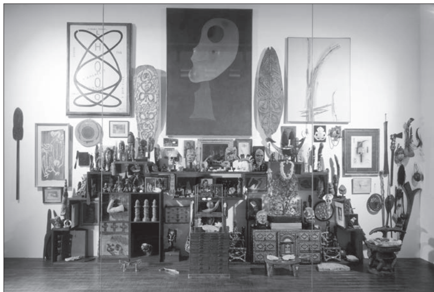
Fig. 2: Reconstruction of the wall of André Breton's studio on rue Fontaine, Paris. Musée National d'Art Moderne, Centre Georges Pompidou, Paris. Paintings by Miro, Picabia, Giacometti: © Artists Rights Society (ARS), New York.

indexed and photographed. 22 This recategorization—with its definitive separation of primitive from modern, high art from popular art, painting from text—does more to dissolve the studio's archival, or meta-archival, function than even the sale itself.