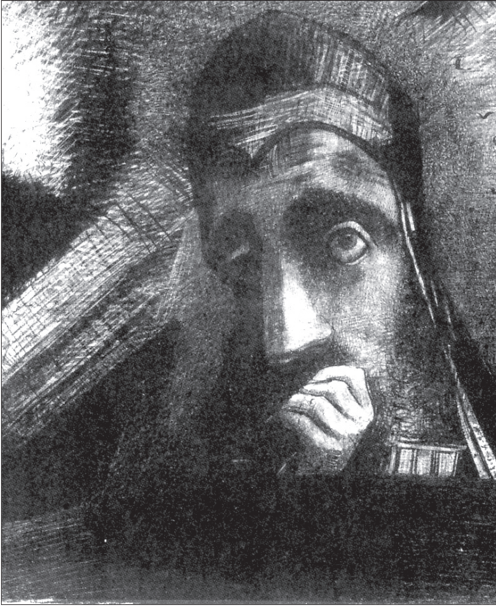
Fig. 2. Odilon Redon, “Dans mon rêve, je vis au Ciel un VISAGE DE MYSTÈRE,” Plate 1 from Hommage à Goya , 1885.

intelligibility. The images are paired with captions that structure the sequence, but the series permits undetermined associations and reversals, allowing a folding of the different faces—the faces of difference—and the affects they provoke.