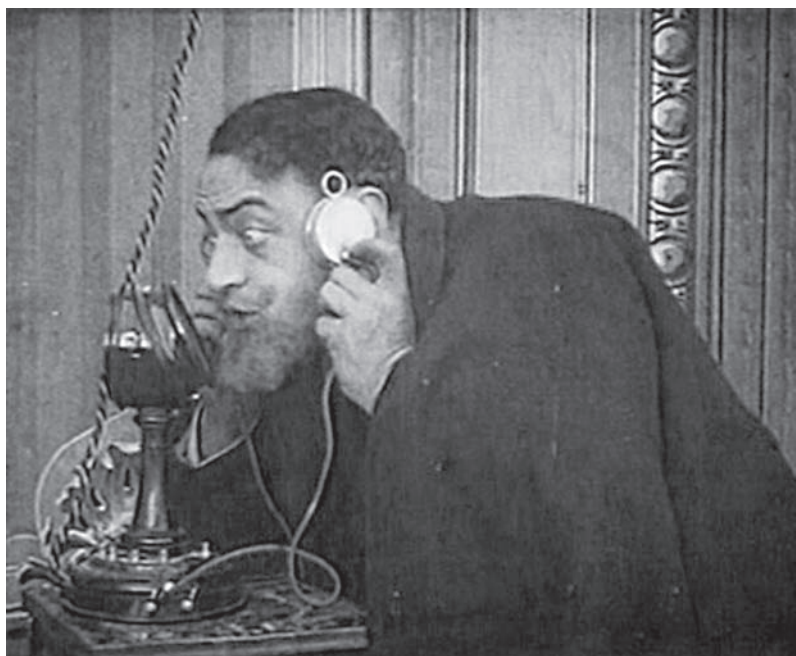
Figs. 4-5. Le médecin du château , Pathé, 1908.