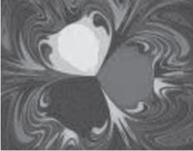
Fig. 2. Fractal basin boundary.

et résumerait en lui ceux qui le précèdent.” (IM, p. 208-209) Bergson’s simile is particularly, almost poetically effective because it not only expresses the smooth or continuous spatial motion of duration as it passes through qualitatively different “states,” but also captures something essential about its texture—the “tints” fittingly express the affective dimension of the inner life, as when we speak of the “coloring” of an event or experience.