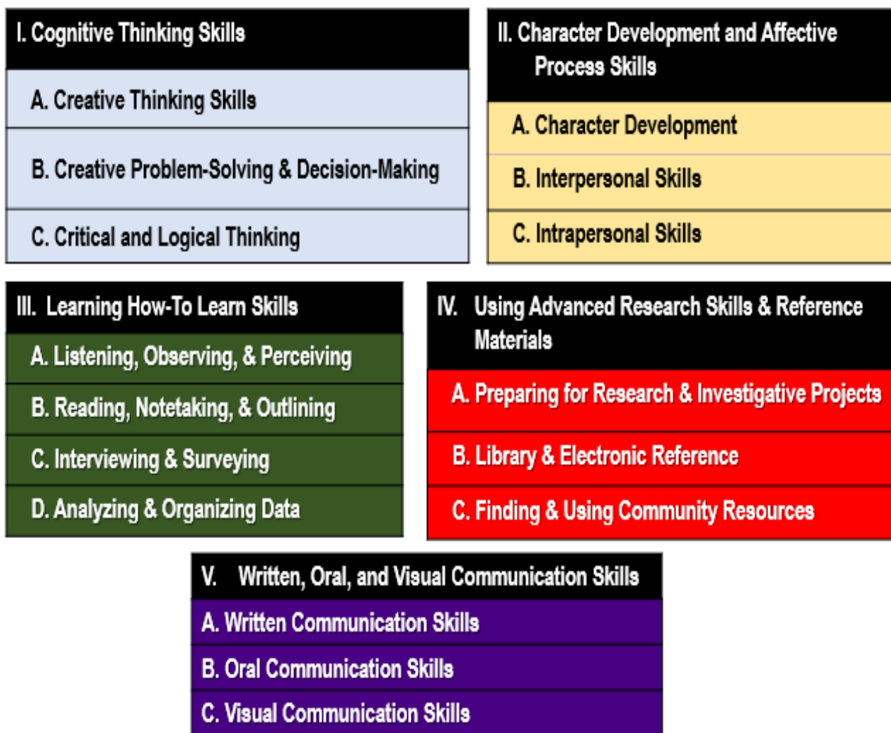
Figure 4: Taxonomy of cognitive and affective processes.

The goals of Type III enrichment include: