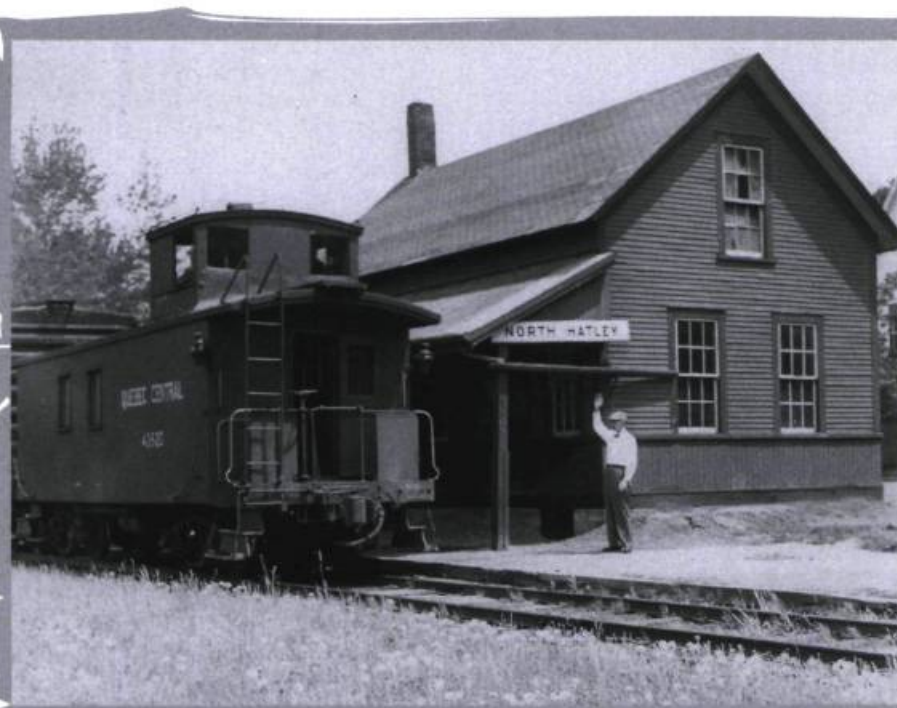
Quebec Central (Canadian Pacific) train at the North Hatley station, May 1954.

With railways playing such a diminished role in the Eastern Townships of today, it is often difficult to appreciate the full extent to which they dominated the transportation scene within the region and across Canada for the better part of a century. The economic and social landscapes of the Eastern Townships were shaped and drastically altered during that Railway Era.