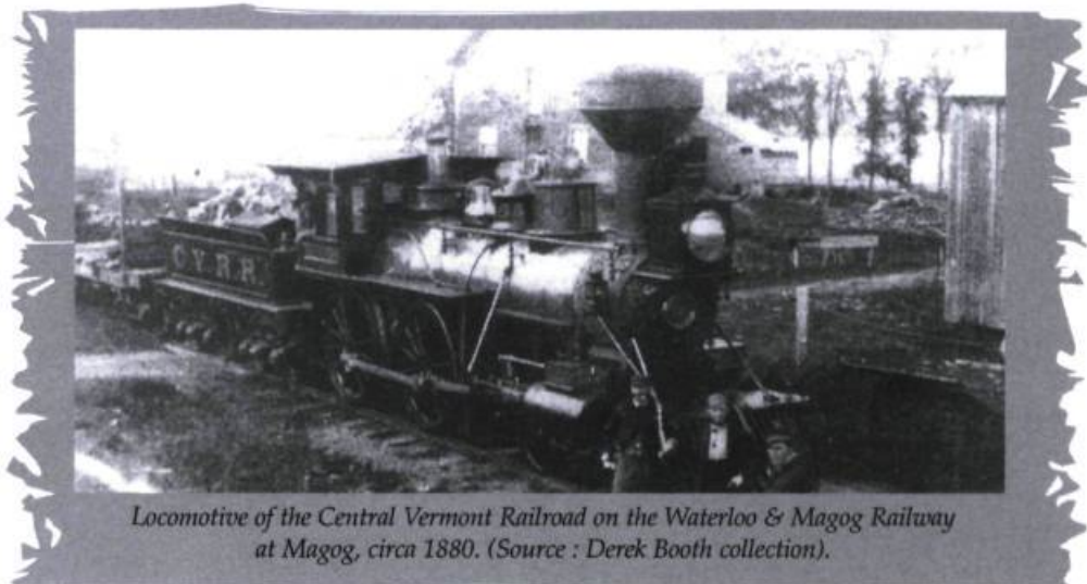
Locomotive of the Central Vermont Railroad on the Waterloo & Magog Railway at Magog, circa 1880.

At the same time that a desire was expressed in Montreal circles to build a railway that would inevitably have to pass through the Eastern Townships, there was also much interest from within the region to have such a railway built. All that remained was to choose the precise route and to find the money for the project. The history of chartering, planning and building of railways in Stanstead County, in Stanstead Township and in the Town of Stanstead, in the period between 1850 and 1890, reflects many aspects of the complicated processes by means of which railways were conceived, planned, promoted and sometimes built.