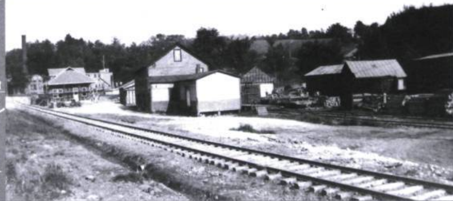
View of the Quebec Central Railway yards in Rock Island in 1927.