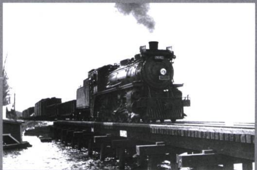
Northbound Quebec Central Railway freight train at North Hatley, May 10, 1955.

Throughout the Eastern Townships, whose complex geology held much promise for mineral development, the mining industry, involving the movement of