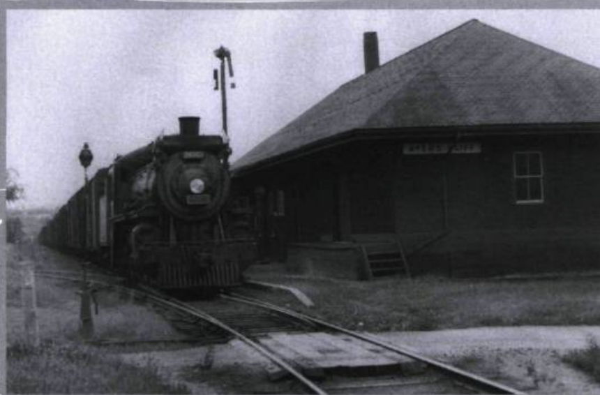
Quebec Central (Canadian Pacific) train at Ayer's Cliff, August 29, 1954.

relatively large tonnages of finished products, was one of those industries whose development on any large scale had to await the arrival of railways. Such was the case for the granite quarrying industry around Graniteville, for the complex of copper mines and smelters at Capelton and Eustis, as well as for the extensive asbestos mining in the Thetford Mines and Asbestos regions.