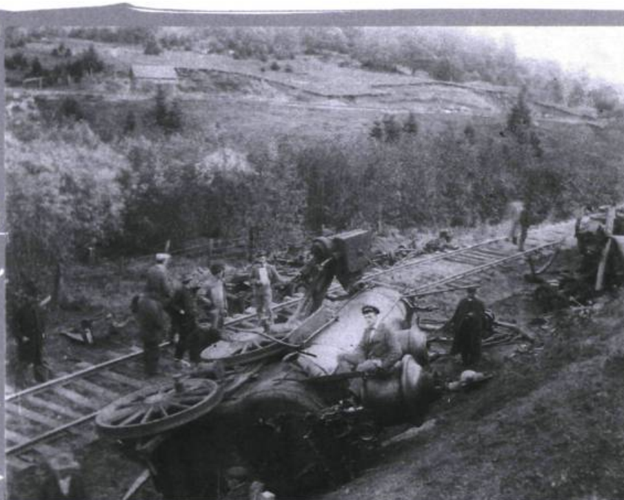
Wreck on the Boston & Maine Railroad near Stanstead Junction (Beebe Junction), October 4, 1900.

It is difficult to overstate the nature of the transport revolution that railways represented. Virtually overnight, they made possible a range of economic and social activities that had been