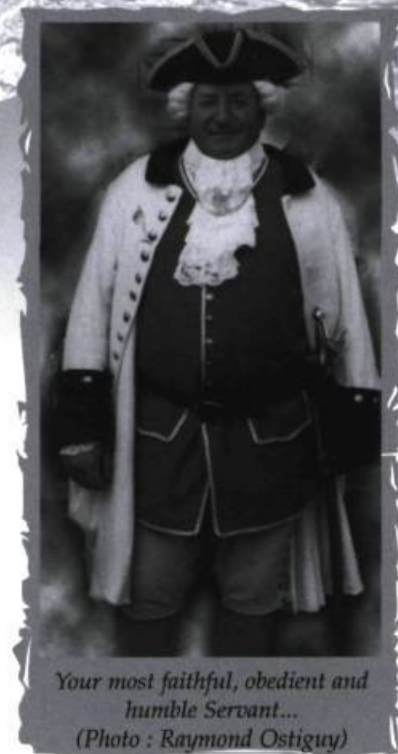
Your most faithful, obedient and humble Servant...

tury re-enactor from the market in Old Montreal for assisting us to step back in time.