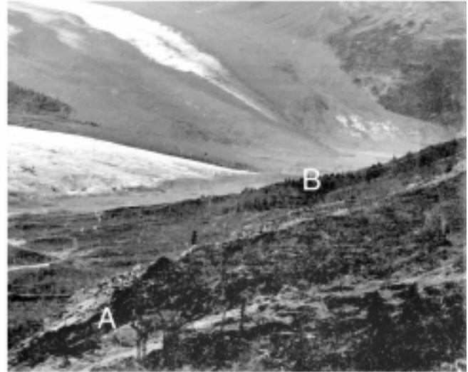
FIGURE 3. Athabasca and Dome Glaciers photographed from Sunwapta Pass in 1906 (right) and 1998 (left). This image is an enlargement of the lower right corner of Figure 2. The letters are explained in the text.

Les glaciers d'Athabasca et de Dome photographés à partir du col de Sunwapta en 1906 (à droite) et en 1998 (à gauche). Cette image est un agrandissement du coin inférieur gauche de la figure 2. On trouvera l'explication des lettres A et B dans le texte.