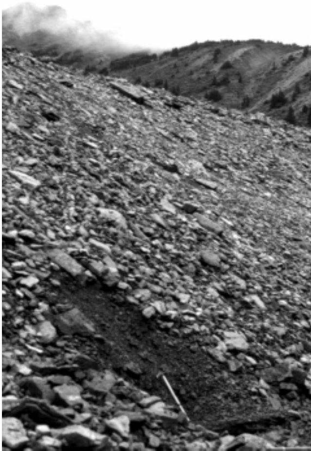
FIGURE 4. Steep frontal margin of the outermost debris complex in the Hilda Glacier forefield. The ice axe sits within our excavation and points downwards to one of the boles recovered from beneath the debris.

Marge frontale escarpée du complexe de débris le plus externe au front du glacier de Hilda. La hache repose dans un des trous creusés dans le cadre de la présente étude et pointe vers un des troncs recouverts de sous les débris.