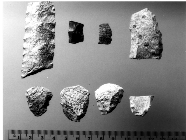
FIGURE 6. Lithic artifacts from Jefferson III. Top Row- Locus 1- Left, Biface midsection; Center Left and Center right, Channel Flake Fragments; Right, Uniface fragment, Bottom Row- Locus 2- End Scrapers, Jefferson, New Hampshire.

A channel flake of dusky red Munsungun chert and the midsection of a parallel sided, collaterally flaked, biface fragment (Fig. 6) were recovered along with non-diagnostic debitage in the tree fall. Shovel test pits were excavated along the broad, loaf-shaped ridge to identify boundaries of the site which covers at least a hectare. More debitage was found along with a side scraper, retouched flakes and another channel flake of very dark gray Munsungun chert. On the basis of the channel flakes, the site was identified as Paleoindian and incorporated in the Israel River Complex. Subsequent to this determination, a woods road was created to remove fallen timber from the site. Erosion triggered by this action revealed additional debitage approximately 80 m from the initial finds. A test trench was excavated along the road in 1997 to explore the depth and extent of the newly defined areas of the site. Additional abundant debitage, primarily Jefferson rhyolite but also including a small percentage of the dusky red Munsungun chert, and four triangular end scrapers (Fig. 6) were recovered. A preliminary assessment of this site indicates a greater emphasis on cutting and scraping tools than in the other two sites in the complex. The area investigated is quite small, however, and the potential for error due to sampling bias or inadequate sample size is substantial.