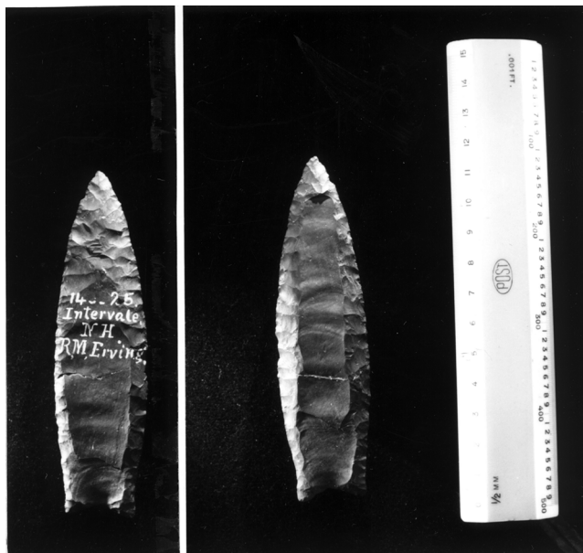
FIGURE 2. Fluted Point, Intervale, New Hampshire. Pointe à cannelure (Intervale, New Hampshire).

The Intervale fluted point (Fig. 2) is made from Munsungun chert and is predominately dusky red in color, mottled with dark reddish gray. The specimen is complete, although it was evidently broken after its initial recovery (but before it was loaned for casting) and has been mended with glue. The point is fluted on both sides with multiple flutes on each. On one surface the flute extends 99.1 mm, terminating 13.7 mm from the tip (the point is 115.3 mm long overall). After this fluting flake was removed, a subsequent, much shorter fluting flake was struck, reaching a maximum length of 27.7 mm. On the other side a similar pattern is observed, however in this case three successive and successful attempts at fluting were achieved. The first flute extended