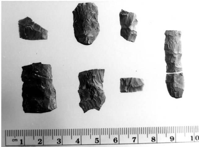
FIGURE 7. Channel Flake Fragments from the Colebrook Site (27-CO-38), Colebrook, New Hampshire.

quality exotic raw material and contrasts sharply with the assemblages from the Archaic loci at the site. The one by two meter test pit also produced 12 circular stains, 3 to 5 cm in diameter and 3 to 10 cm deep and were encountered 50 to 63 cm below the surface. The excavators interpret these as post or stake molds in two intersecting arcs aligned around the hearth feature (Bunker et al. , 1997: 20). They extrapolate the pattern to reflect a potential structure with a roughly circular diameter of approximately three meters.