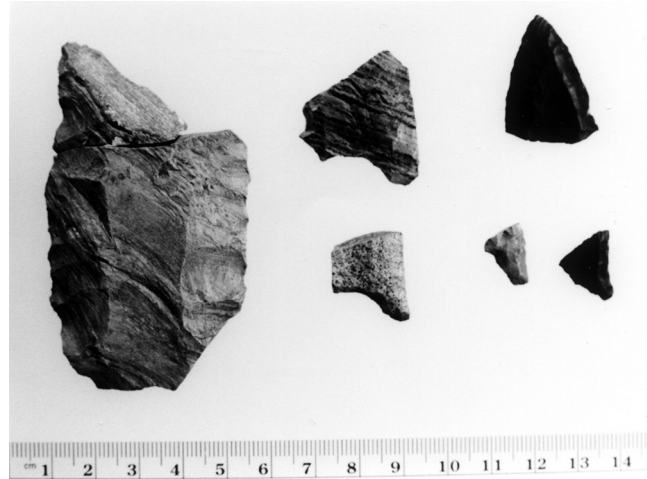
FIGURE 5. Fluted Points from Jefferson II (27-CO-29), Jefferson, New Hampshire.

A single radiocarbon sample has been processed from Jefferson II but has been of little help at determining the age of the site. A fragment of wood charcoal was obtained 46 cm below the surface in the till deposits in the large excavation block. The fragment of charcoal was situated in the soil matrix 12 cm from a tip of a bifacially worked preform. Recovered in the same soil as the sample were four very small flakes of what appears to be a high quality translucent white chert or chalcedony. The AMS date (Beta-108465) is 8570 \pm 60 radiocarbon years. The calibrated date is 7550 BC, or 9600 years ago. The date is more than a thousand years too young to be