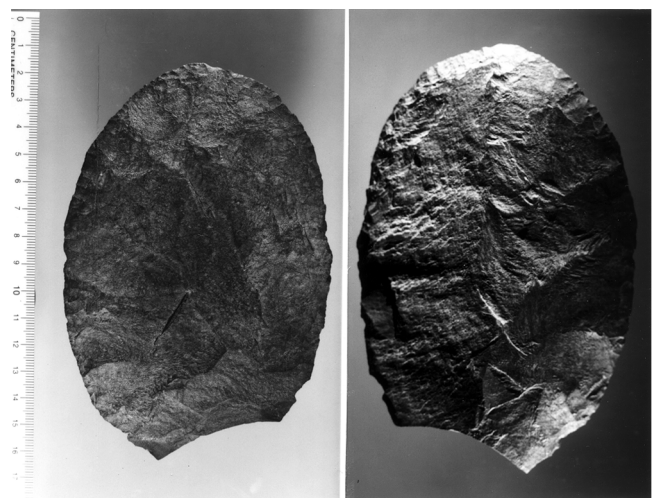
FIGURE 3. Lowe Biface, Randolph, New Hampshire. Biface de Lowe (Randolph, New Hampshire).

The artifact (Fig. 3) is a large elliptical biface made on a very large flake and evidently thinned so as to reduce, but not completely eliminate, the curvature of the original flake. The raw material is of an unknown lithic resembling chert or a high quality rhyolite, and is very dark gray, almost black, in color. The specimen measures 147.2 mm long, 98.5 mm wide and has a maximum thickness of 15.8 mm near the striking platform end of the original flake. The surfaces of the biface exhibit well controlled percussion flaking reflecting two general varieties. Except for a portion which retains the unmodified initial flake interior surface, most of the surfaces exhibit large, broad flake scars which extend from the bifacial edges to the longitudinal midline and are up to 50 mm in length and up to 30 mm wide. They are suggestive of a broad ended soft hammer percussor, such as an antler billet. The flake scars reflect broad, thin flakes and most terminate in wide, shallow, hinge fractures with the remainder terminating in sharp or feathered edges. Subsequent to the removal of these broad invasive flakes, the margins were trimmed by a series of consistently short flakes, rarely exceeding 7 mm in length and usually less than 5 mm wide. Virtually all of these flakes terminate in hinge or step fractures. The bifacial edge of the specimen is sharp and the arrises of the shorter suite of flake scars are unworn. The arrises of the larger