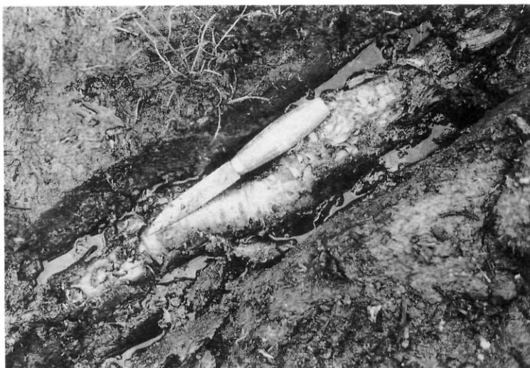
FIGURE 2. Small erosion scar in peat deposit, 1010 m a.s.l. Dépôt de tourbe à 1010 m d'altitude.

Thirteen radiocarbon dates of tree-sized birch are presented for the elevational band 1000-1015 m a.s.l. and ranging, evenly dispersed, between 8680 \pm 100 and 3415 \pm 70 yr