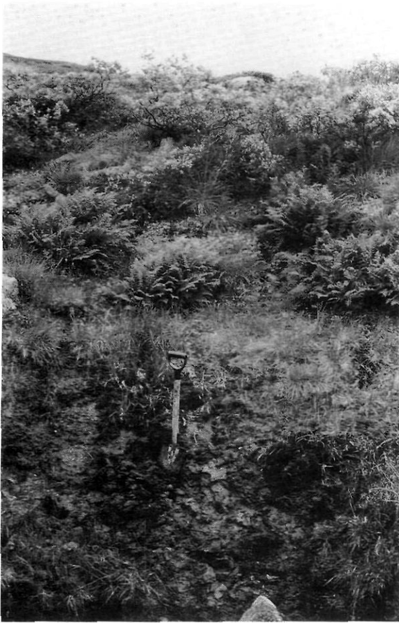
FIGURE 5. Subfossil birch is often found in depressions with excessive snow accumulation, indicated by fronds of Athyrium distentifolium . This is the site for the oldest birch ( 8680 \pm 100 yr BP, ST-12980).

On trouve souvent des fossiles subrécents de bouleaux dans des dépressions où il y a accumulation excessive de neige, qu'indique la présence d' Athyrium distentifolium . Ce site a abrité le plus vieux bouleau ( 8680 \pm 100 yr BP, ST-12980).