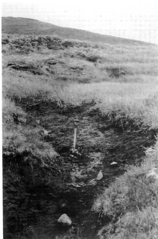
FIGURE 4. View of the study site (1005 m a.s.l.) in early June, showing its character as snow accumulation area.

Vue du site (1005 m d'altitude) début juin, illustrant son caractère de zone d'accumulation de neige.