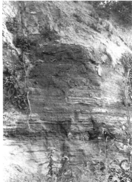
FIGURE 4. Compact, fissile autochthonous peat of a floodplain swamp (layered dark material in middle) between interlayered organic-rich floodplain silt and sand (below), and mixed alluvial fan gravel and debris flow diamicton (lighter sediment, above) at Muir Point (knife at centre is 20 cm long).

Macrofossiles dans le silt, sable et gravier interstratifié riche en matière organique de l'unité de plaine d'inondation à Muir Point (le couteau mesure 20 cm).