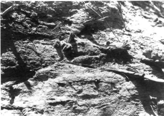
FIGURE 3. Macrofossils in interbedded organic-rich silt, sand and gravel of the floodplain unit at Muir Point (knife is 20 long).

Macrofossiles dans le silt, sable et gravier interstratifié riche en matière organique de l'unité de plaine d'inondation à Muir Point (le couteau mesure 20 cm).