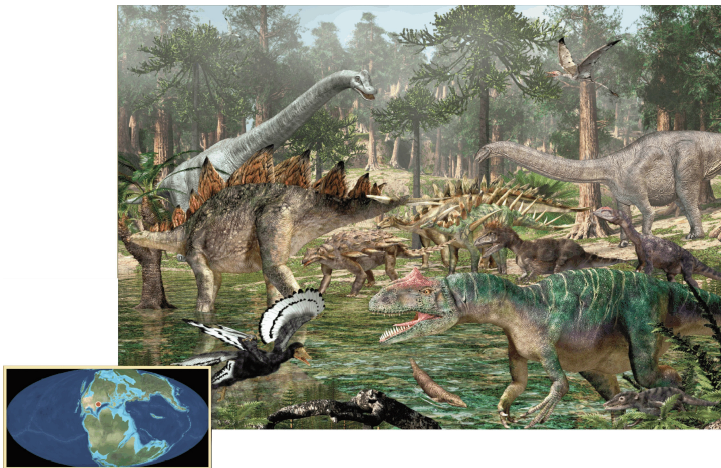
Figure 3. Artist's depiction of a Jurassic landscape and fauna in North America, from the United States Geological Survey "Trail of Time" website ( www.usgs.gov/youth-and-education-in-science ). The painting naturally depicts a wide variety of dinosaurs, some of which will be familiar. Although species might have differed in detail, some are probably representative of predators that lurked on the scattered islands of Jurassic British Columbia. Note that the vegetation is dominated by conifers and cycads, rather than the flowering trees of today's tropical regions. Inset shows Jurassic paleogeography, which is quite different from what we see on the world map of today.

inated by massive conifers and cycads - evergreen plants that resemble modern palms - and flowers (as we know them) had yet to evolve. What would it be like to go back in time and sail ancient turquoise seas in this Jurassic Eden, or to walk on its beaches of (presumably) black sand? We are told that the laws of physics will always forbid such excursions, but I feel sure that most geologists would jump at the chance if offered to them, even with the ever-present risk of being eaten by some sort of Saurus . Although the dinosaurian villains that populate the Hollywood version did not actually evolve until the Cretaceous, the reconstruction of Jurassic fauna provided by artists of the United States Geological Survey (Figure 3) implies that a variety of dangerous predators awaits any careless time-traveller.