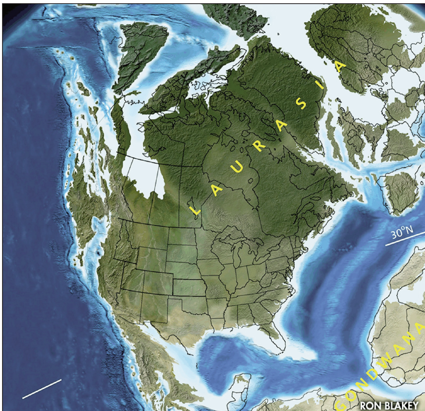
Figure 2. Reconstruction of North American paleogeography for the early Cretaceous period. The maze of islands located north and west of present-day British Columbia represents the area where the sedimentary rocks of the Laberge Group were deposited in an active tectonic environment during the Jurassic. The Rocky Mountains, which dominate the Canadian Cordillera, are just beginning to develop; over time their growth will rearrange continental drainage, to create the Paleogene and Neogene Bell River basin, which connected parts of the Cordillera to the Labrador Sea. The Labrador Sea is just beginning to develop on the opposite side of North America at this time. Original diagram by Ron Blakey, from the book Four Billion Years and Counting , published by the Canadian Federation of Earth Sciences.

and conglomerates of the Jurassic Laberge Group, which also preserves information on how this sedimentary basin was locally deformed and uplifted, even as other parts of it were still accumulating. Painting a picture of this vanished world reveals a much stranger place, but it does contain some characters familiar to most children, even if they do not have geol-