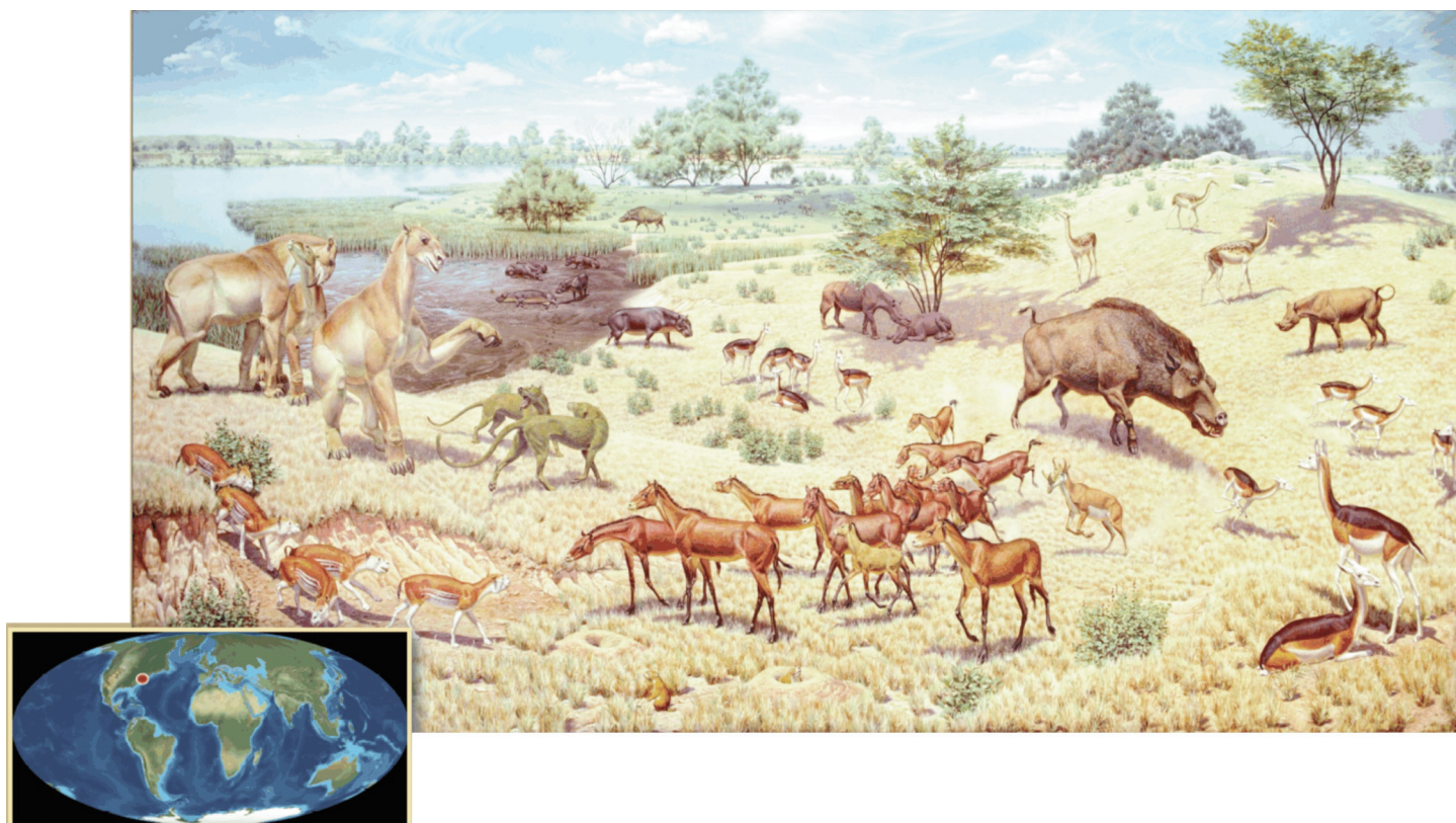
Figure 1. Artist's depiction of a Miocene landscape and fauna in North America. The painting depicts a wide waterway in the background, which can perhaps be thought of as the Bell River although (strictly speaking) this scene is intended to represent Virginia. The inset shows a global plate reconstruction for the Miocene Epoch, which broadly resembles the world map of today. Is this what the landscapes around the pre-glacial Bell River would have looked like?

and different places, even though it really should not surprise me. But when I read their paper as an editor, I wanted also to step beyond long-distance zircon transport and try to visualize this vanished world. This colossal drainage basin was initiated during one of the warmest climates in the geological record, so coal swamps existed in its delta, and as far north as present-day Ellesmere and Axel Heiberg islands. Forests flourished in landscapes we see today as ice-carved tundra. What other landscapes and environments existed across the land we now call Nunavut? During these warmer times, much of Ellesmere Island was probably covered by vegetation similar to modern Boreal forests, and pollens from vines and other semi-tropical plants are reported from other high-Arctic locations. What would it have been like to stand on a summit in the ancestral Torngat Mountains, and gaze across distant flatlands within a vast rift valley that would one day become an ice-choked sea? If only we could travel there, we could drift downstream with the waters of the Bell and see the remarkable mammals of the Paleogene and Neogene along its banks. We will never know all the details, but surely such a mighty river would be a vibrant ribbon of life, just like those of today. Artists have recreated many of the North American mammals of these times (see Figure 1), and the image for the Miocene clearly includes a large waterway.