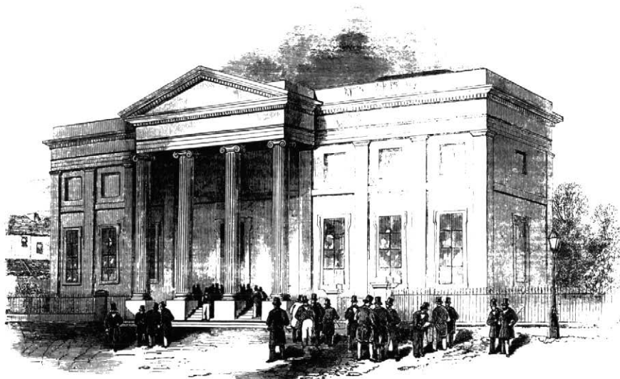
Figure 6 The Royal Institution of South Wales in 1848 (from the Illustrated London News , 19 August 1848, v. 13, p. 109).