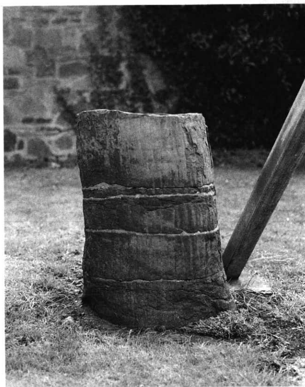
Figure 8 "Logan's Trees" as they stand today outside Swansea Museum. These two fossil trees ( Sigillaria ) were discovered in 1838. The taller is 13.5 feet high and the shorter, 4 feet.