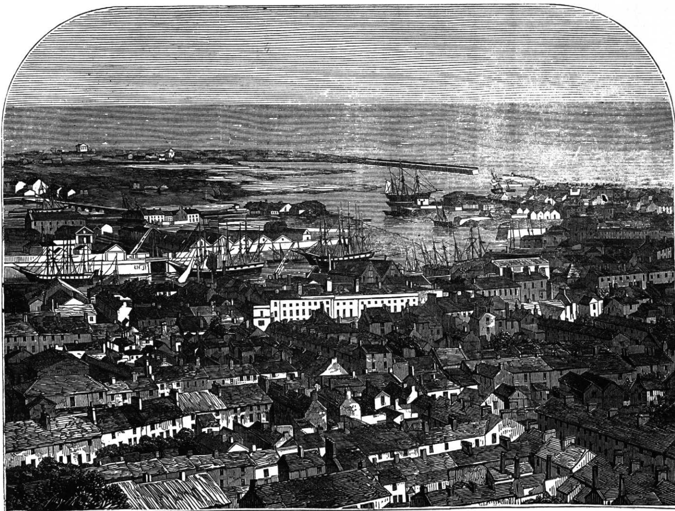
Figure 1 Swansea and the Harbour in 1848 (from the Illustrated London News , 19 August 1848, v. 13, p. 109).