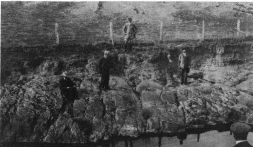
Figure 5 (upper) Outcrop of Late Paleozoic Dwyka Tillite, South Africa, with W.M. Davies, the geographer, 1905.