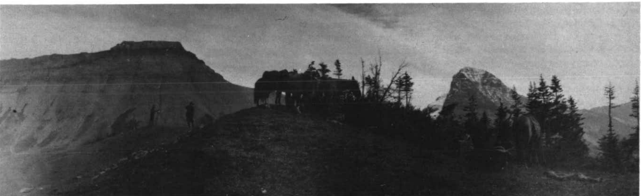
Figure 1 (top) Exploration party in front of an ice cave at Athabasca Glacier. (second from top) "We found fifteen lodges of Stoney Indians camped on the Kootenay plains near the foot of Sentinel mountain. As we passed they were just breaking camp in picturesque confusion, dogs barking, women taking down the canvas from the conical frame of poles, and looking up piebald or buckskin ponies to pack their household goods upon." (third from top) Stoney Indian hunting group. Every summer they left their lodges for tepees in the Bow Valley; mountain sheep were on the decline however, because of white hunters. (bottom) Surveying in Yoho National Park at Burgess Pass with Mounts Stephen and Field in left and right background, respectively.