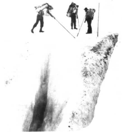
Figure 4 (upper left) Swimming ponies across the Athabasca River, 1908. (middle left) Writing up field notes prior to travelling in a dug-out canoe down the Athabasca River. (lower left) Coleman and assistant on the Main Glacier near Mount Robson, 1908. (above) Negotiating a large crevasse.