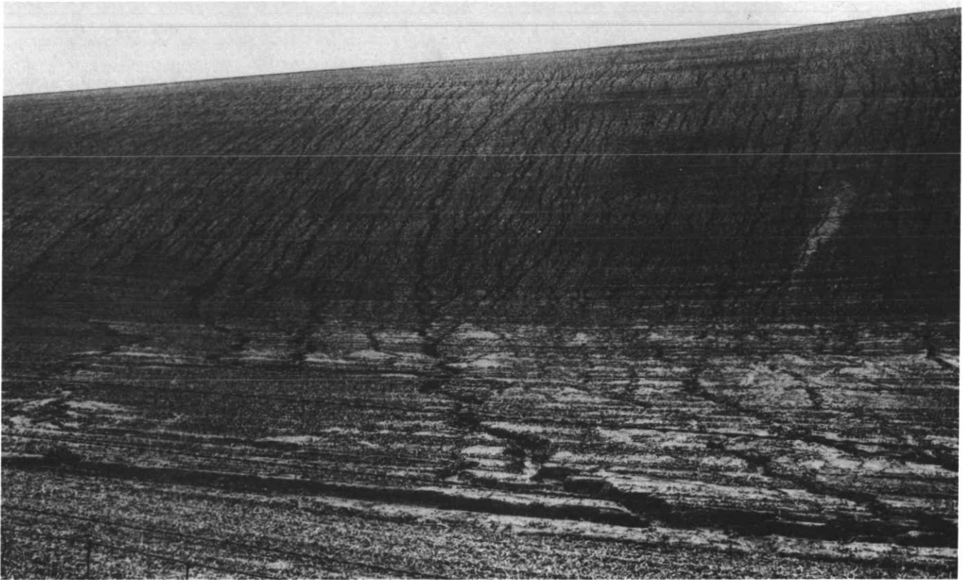
Figure 1 Modern agriculture in Washington's Palouse basin. Soil losses in the range 20-200

tons per acre per year. Will the rates increase?