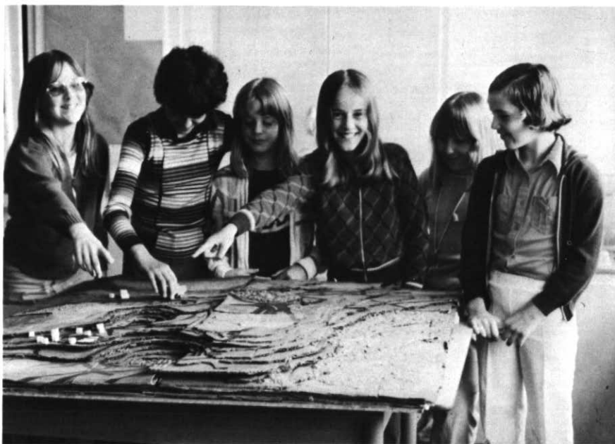
Figure 1 Grade 7 students in B.C. built a model of an open pit mining operation to familiarize themselves with the people and processes in mining. The students and teachers in B.C. and Ontario are involved in the

Completing ongoing programs in two Provinces as well as starting the Project in others, remains a question of available funds. Besides mining companies, the fundraisers are approaching the support industry, suppliers, unions, banks, accounting firms, professional services and individuals for contributions. Associated groups such as the Mining Women's Association of Greater Vancouver are assisting the project with materials and other services.