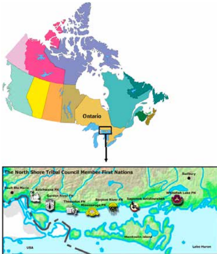
Map 1: Location of the North Shore Tribal Council First Nations

payments to member First Nations for delivery of community support services (i.e., primary child welfare prevention).