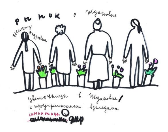
Figure 9. Alevtina Kakhidze, "Rynok v Zhdanovke" ("Market in Zhdanovka"), marker and colour pencil on paper, 2014, courtesy of the artist.

Among the most insistent and potent messages that Kakhidze voices with her series of drawings is an acceptance of the heterogeneity of identities, populating the Donbas.<sup>29</sup> Just like the plants in her garden, Kakhidze believes that people with dissenting opinions can tolerate each other and live peacefully without blame and prejudice. Similarly, for Rancière "dissensus is a political core constituting the community" (188).