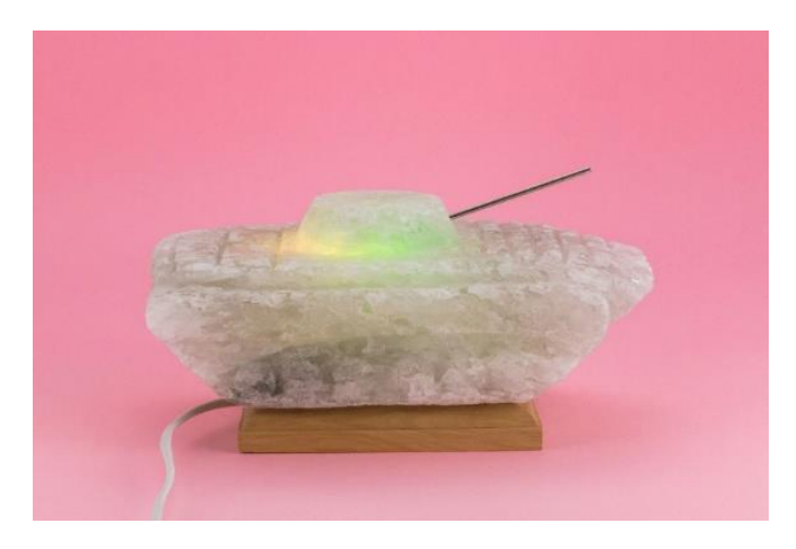
Figures 12, 13, and 14. Lia Dostlieva and Andrii Dostliev, Zalyzuiuchy rany viiny (Licking War Wounds), 2016-21: week 1, week 167, week 240 (the final week), courtesy of the artists.