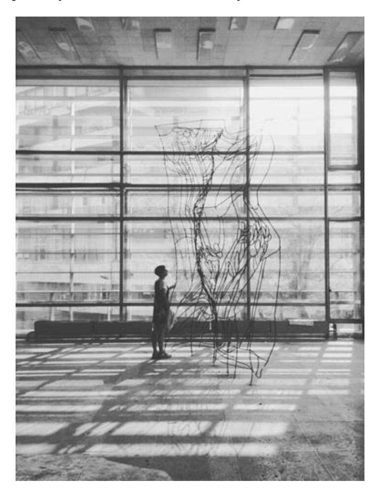
Figure 10. Anna Zvyagintseva, Namaliuvaty svoie vikno, zim"iaty papir ( To Draw Your Own Window, to Crumple the Paper ), 2015, bar reinforcement, welding, iron wires, The School of Kyiv, Kyiv Biennial, 2015, photo by Oleksandr Burlaka, courtesy of the artist.

The Order of Things demonstrates the fragmentation and dissipation of reality inflicted by the trauma of war. Zvyagintseva renders her old drawings of women walking with children or picking flowers by welding metal, demonstrating the fragility of everyday life by contrasting the coarseness of her material with the delicacy of her drawing style. Yet even the sturdiest of metals cannot withstand the brutality of war. We notice how the contour is broken and the metallic lines are falling, creating by chance some crude