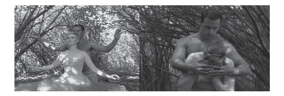
7. Inside the copse

From there they begin to move their arms in unison from side to side like coral in the waves. Their wavelike gestures give the appearance of a patterned union and replicate the arches of the surrounding trees. The woman's hands never touch her own body, but her partner's hands move closer to her. The couple rise, the male standing behind the female, and they repeat the sequence. She drops her head, covers her eyes and slowly moves her head from side to side, imitating the earlier gesture of the male. It is as if she is disturbed and trying to hide from the awakening, which by its very nature is painful. The male recognizes her sorrow and empathizes with her, as he places his hands on hers and moves with her as she rolls her head.