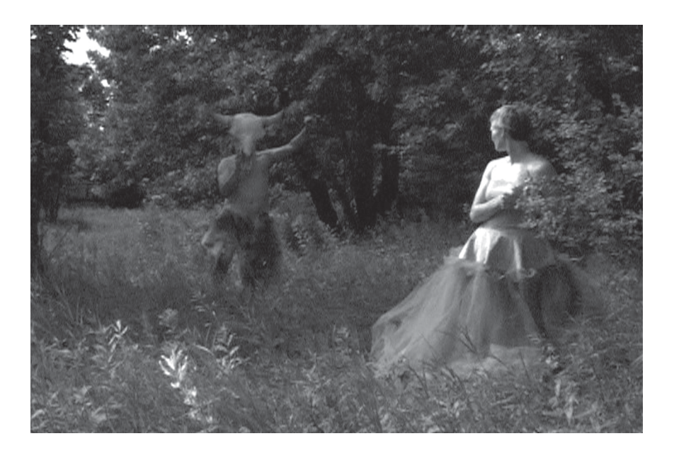
9. The Shadow revealed in direct confrontation.

Suddenly, the music changes and the entire screen darkens with the shadow of the minotaur once again. This time, however, it is not a static shot as it is at the beginning, but a moving one. The shadow becomes larger and larger as the minotaur moves closer and the viewer sees just a bit of a body cloaked in animal skin. But it is enough to shift the scene. What was a shadowy premonition at the opening of the piece has turned into reality. Its relation to the woman at this point is unknown, and since the image of the minotaur is mythic, only partially visible and ambiguous, its presence is dramatic and unsettling.