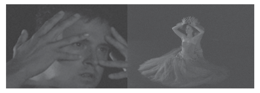
5. A conscious connection begins to grow

This time the couple is standing, and although they do not touch, they respond to each other's gestures. First the woman leads, then the man. The couple begins to open up more and more to each other. The movements become larger and the woman, in particular, becomes more expressive, turning in a series of circles, which represents the desire for inner unity and the ultimate state of Oneness. She circles once more and floats to the floor, her dress whirling around her in a violet swathe. The male follows and sits down close behind her. At this point, the only point of physical contact was at the beginning of the movement when she touched his shoulder. Since then she has kept her distance so as to remain untouched herself.