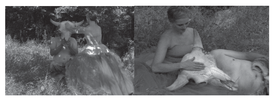
10. Submission 11. At rest

With slow, deliberate steps she follows her animus to the edge of the woods where he kneels in front of her. She places her hands on his forehead and her touch makes him tremble. At this point, there is a transference of power between them; woman and animal share a vital connection.