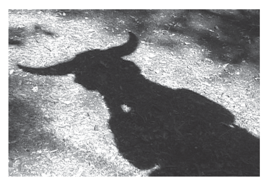
1. The shadow appears.