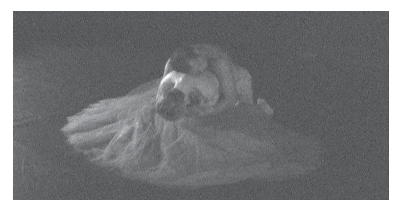
6. The embrace

The dialogue between anima and animus continues through the use of stylised hand gestures. They shape their hands into "ducks" and proceed to "talk" and nip playfully at each other. The motion then changes to a moving crown of fingers placed above the female's head, to indicate graceful thoughts and a growing conscious, and perhaps intellectual connection with the other. Then, for the first time, the movement begins to show direct physical contact. Gently, the man wraps his arms around her from behind, enfolding her like a bird or a butterfly, and the couple bend forward and come to rest. Eyes and faces are hidden, as the holding is a silent, non-discursive experience. The point of contact now becomes the centre of the body and the second movement ends with the embrace.