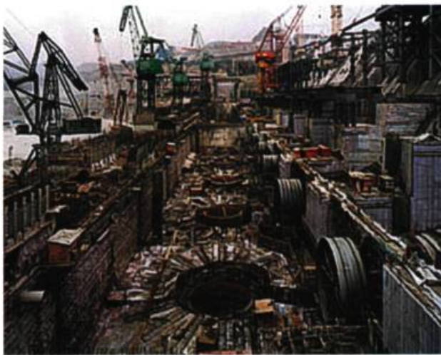
Ed Burtynsky, Bao Steel # 8 , Shanghai, 2005. Digital Chromogenic Print; size variable.