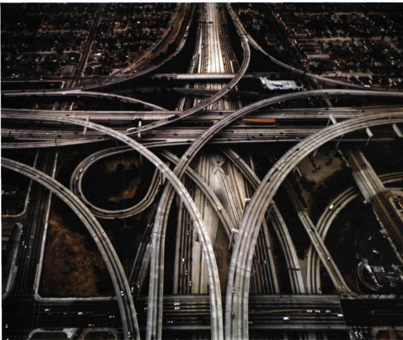
Ed Burtynsky, Highway # 1, Intersection 105 & 110, Los Angeles, California, 2003. Digital Chromogenic Print; size variable.