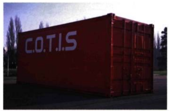
KIT, C.O.T.I.S. , 1998. Exterior view of C.O.T.I.S. Container.