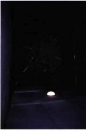
KIT, C.O.T.I.S. , 1998. Interior view of C.O.T.I.S. Container.