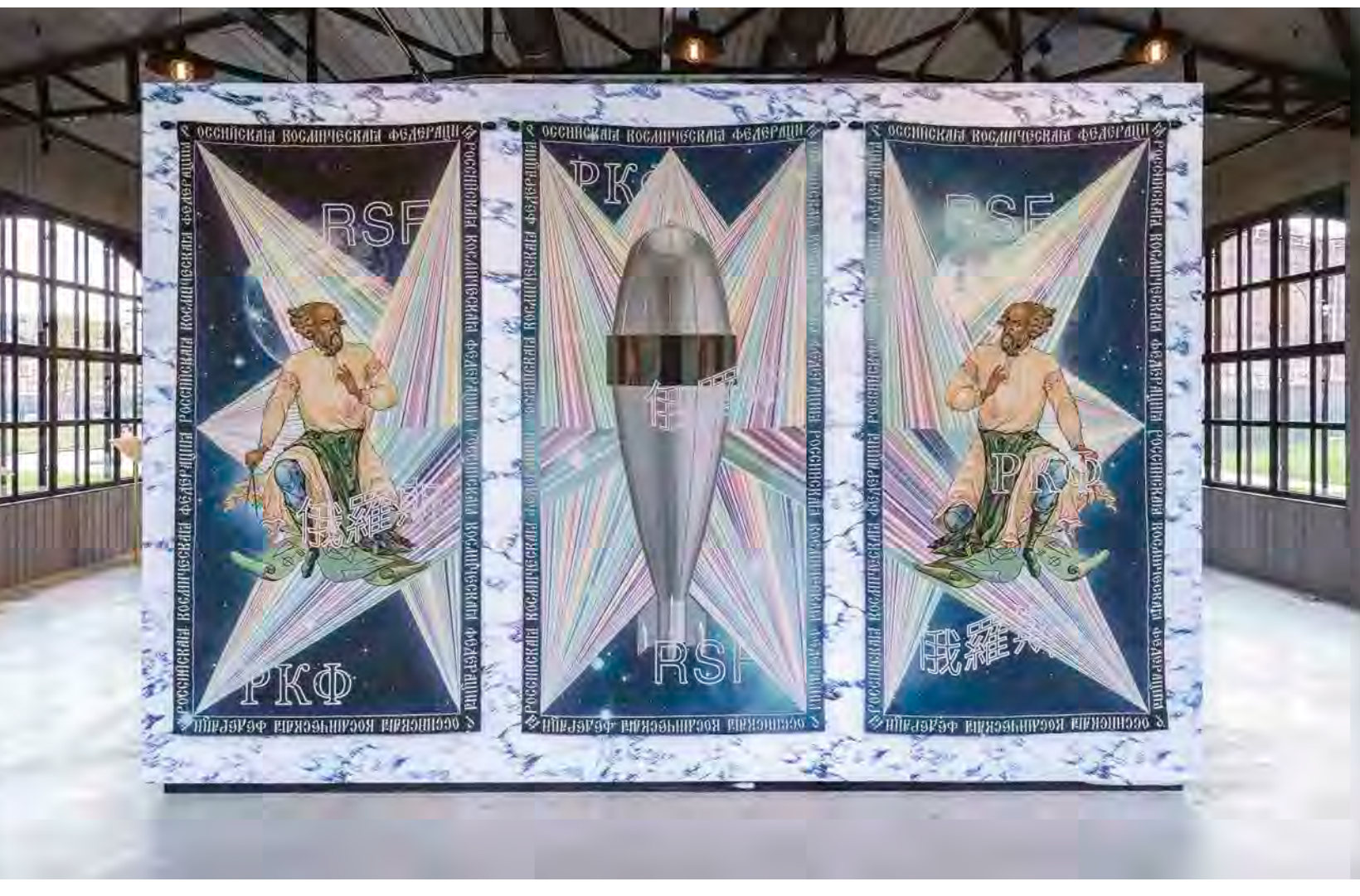
Arseny Zhilyaev , Tsiolkovsky , Second Advents , 2016. Mixed media. Gazprombank Collection.