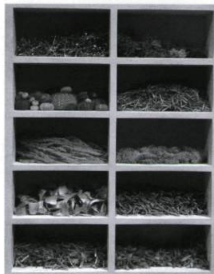
LYNDAL OSBORNE, Tableaux for Transformation , 1998. Mixed media. Collection of the Alberta Foundation of the Arts.

Osborne, while not referencing the divine or sacred within a theological context per se , nonetheless recognizes the inherent power and