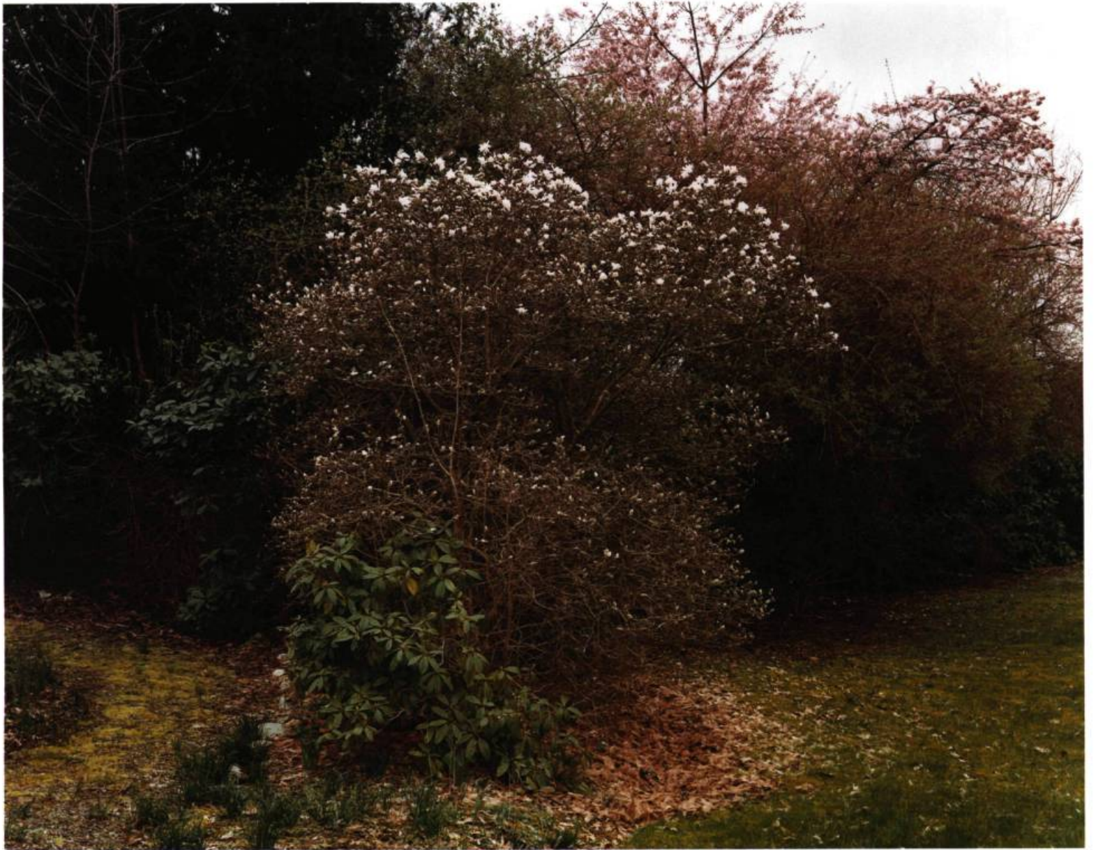
Tree Study; Magnolia stellata, Prunus cerasifera colour print 76 x 96cm 1999