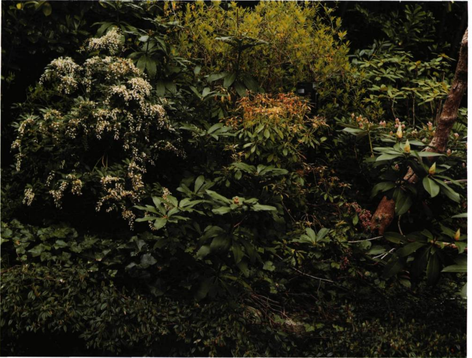
Pieris Japonica, Hedera, with Motion Sensor colour print 76 x 96 cm 2000