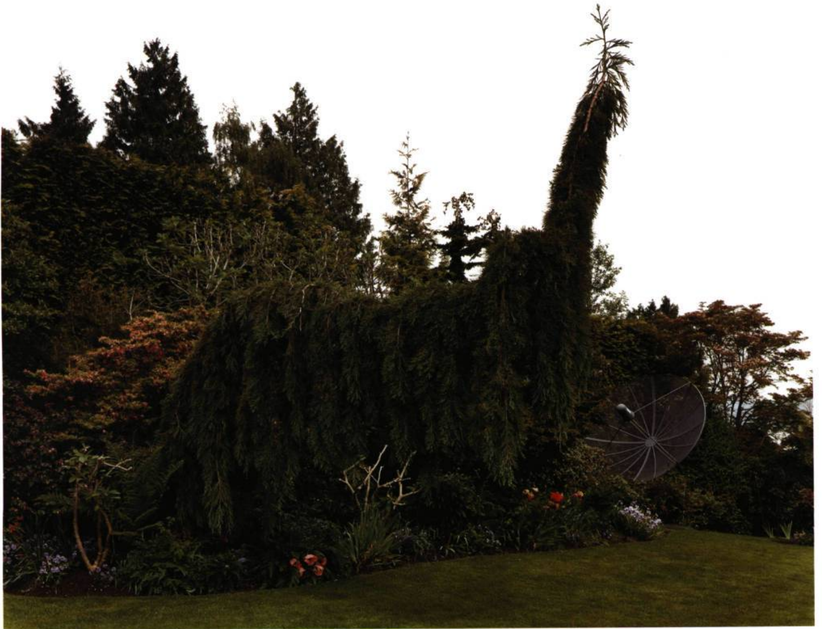
Hedge with Border, Study; Chamaecyparis, Papaver, Satelite Dish colour print 76 x 96 cm 2001