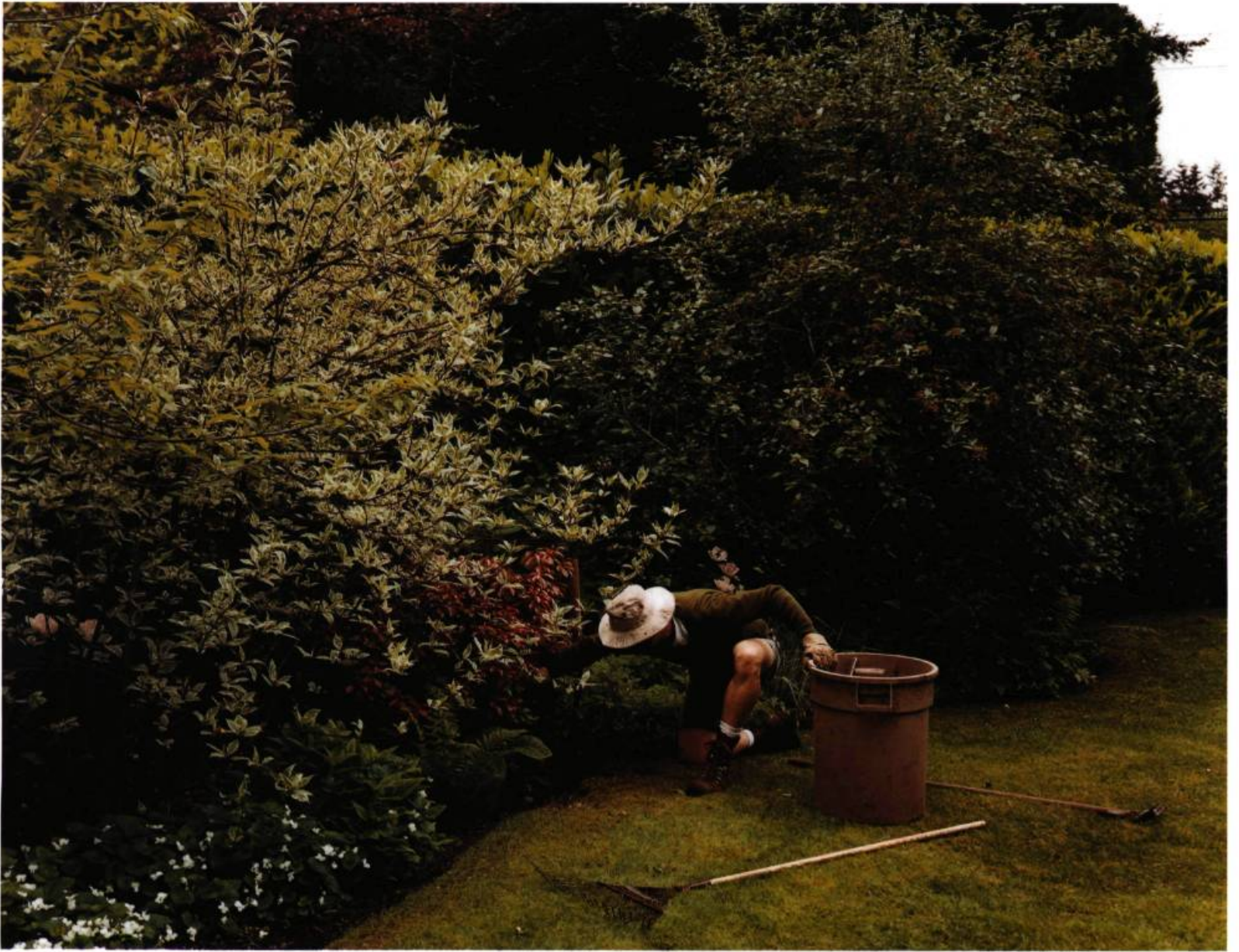
Pulling, Spring Maintenance, Raymond Lachance colour print 76 x 96 cm 2000