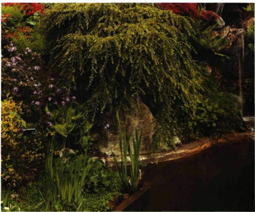
Sick Optix Motion Sensor with Acer palmatum f. atropurpureum, Tsuga canadensis 'Pendula' colour print 76 x 96 cm 2000

tion. Though the technical specifications of McFarland's project – bulky medium-format gear and long exposure durations – required the consent of the workers and landowners whom the photographs depict, this consent was in no way assured. McFarland's earliest garden images depicted unoccupied properties up for sale or owned by offshore landlords, shot from the street or from ungated driveways, a covert process whose willfulness and conceptual independence under-