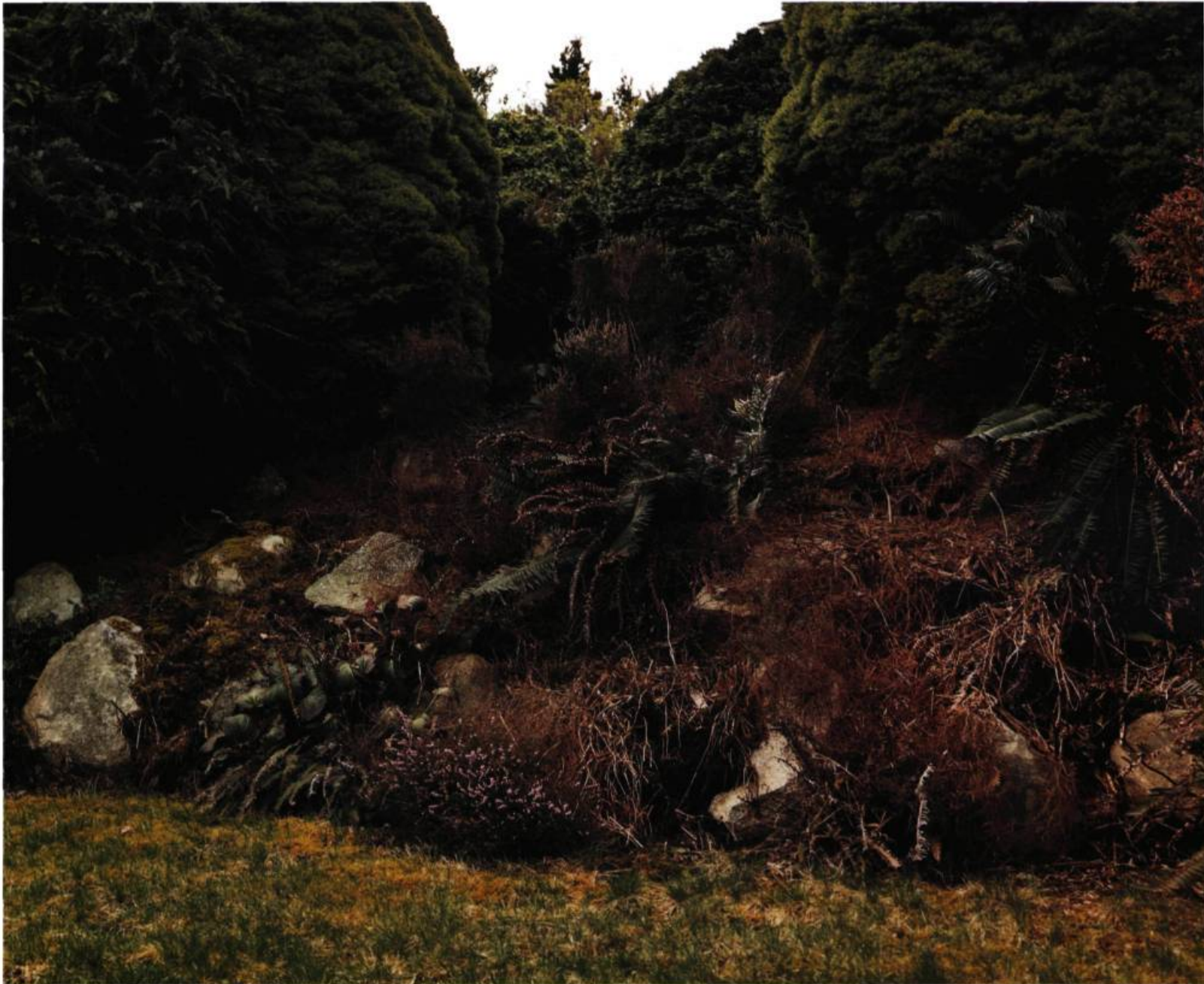
Border Study; Polystichum Munitum , Calluna Vulgaris , Picea Glauca Var, Albertina "Conica" colour print 76 x 96cm 1999