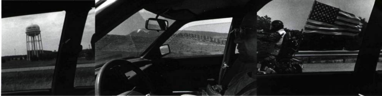
De villes en déserts série de 62 épreuves argentiques, format variable 1998.