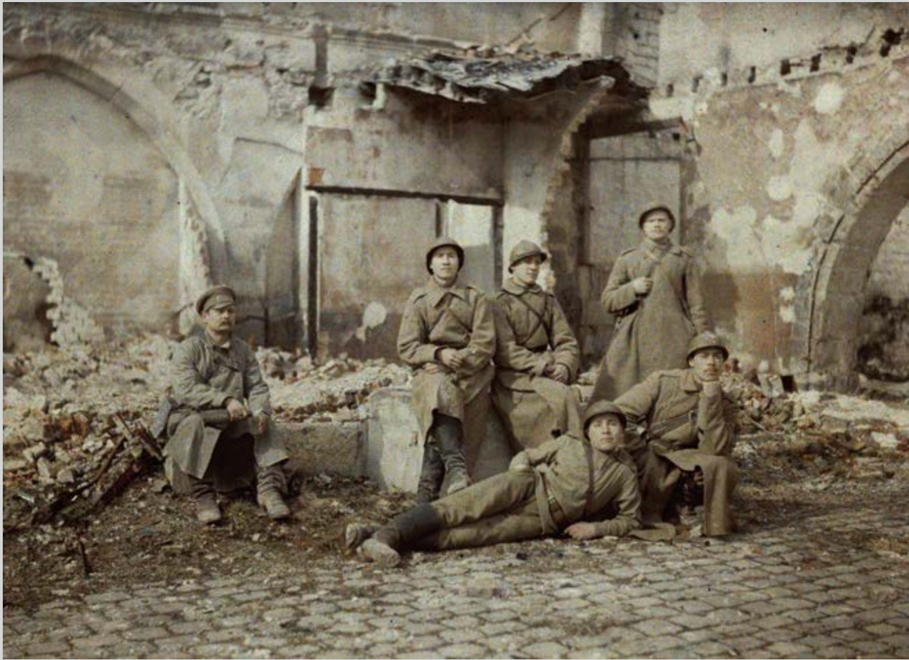
Fernand Cuville, Russian Soldiers at the Convent of Les Cordeliers , 1917, inkjet reproduction of original autochrome, 9 x 12 cm, Médiathèque de l'Architecture et du Patrimoine, Montigny-le-Bretonneux. CVL00046

of truth-telling: they cannot adequately capture the enormity of the events in question, and yet, in its aftermath, they serve as vital evidence to piece together what transpired. They signal events but they cannot contain them, however strong the desire for such closure. Photographs are encapsulations – moments that are selected, framed, and lifted out of time and space. They exist both in history and out of history and serve as much as evidence as invention. They occupy a curious terrain of permanent present – and yet, by virtue of their content, they offer the viewer a glimpse into something that once was. As visual arguments, they propose a point of view that requires a willing viewer who understands their signs and symbols. As aesthetic objects, they command a presence in their own right, while simultaneously serving as traces of action that transpired in the past.