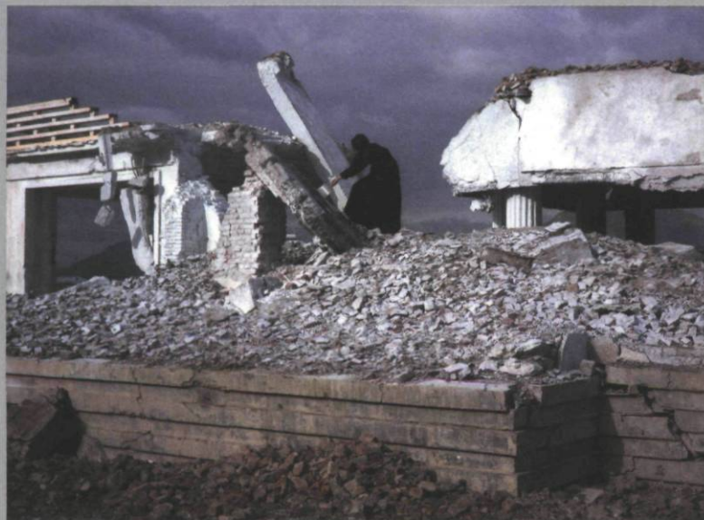
White House, 2005, Film Production Still