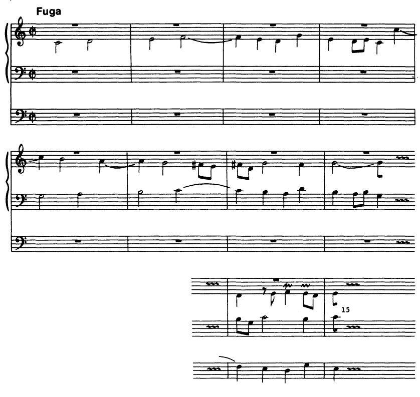
J.S. Bach: Praeludium et Fuga in C (1708-17) (BWV 545).