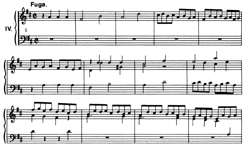
C.F. Hurlebusch: Compositioni musicali (1734?), Parte Seconda, IV. Fuga.

As is clear from a comparison of the principal subjects of both works (see Ex. 1a), Bach immediately discarded the descending sequential eighth-note figuration that makes up the concluding half of Hurlebusch's subject since it detracted from the severe, ponderous nature of the imposing initial fragment and since this figuration, in contrast to the strict treatment of the initial fragment, is treated in a free and highly inconsistent manner throughout the course of Hurlebusch's working out: