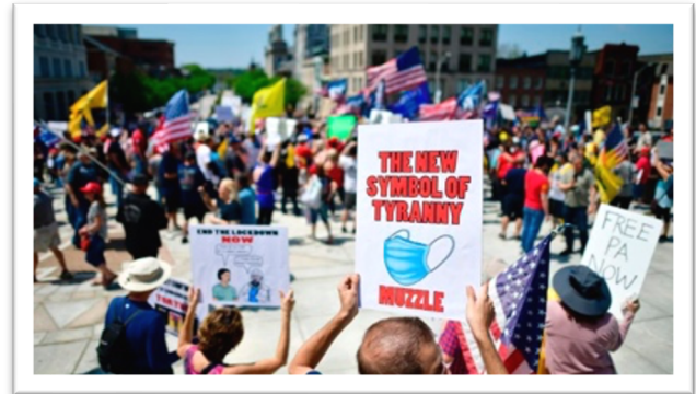
Figure 3.. A demonstrator holds a placard with a face mask stating, “THE NEW SYMBOL OF TYRANNY MUZZLE.” People had gathered outside the Pennsylvania Capitol Building to protest the continued closure of businesses due to the coronavirus pandemic on May 15, 2020 in Harrisburg, Pennsylvania. 110

The discourse of mask as a symbol of rights and freedoms was constructed in opposition to the idea perpetuated with the circulation of the discourse of mask as PPE. The later discourse was deployed in efforts to limit the virus’ spread by appealing to the individual decisions of millions to comply with public health directives to wear masks in public. As bioethicist Nancy Kass, deputy director for public health of Johns Hopkins University’s Berman Institute stated, “masks can be a form of virtue-signaling. By wearing a mask, people show their concern for keeping other people safe.” 42 Habitual mask wearing is constructed as a civic duty in the discourse of face mask, both to protect others and to take responsibility for oneself, especially seen in Eastern Asia cultures, such as China and Japan. An article by the South China Morning Post acknowledged that “wearing face masks is often seen as a collective responsibility to reduce disease transmission and can symbolise solidarity.” 43