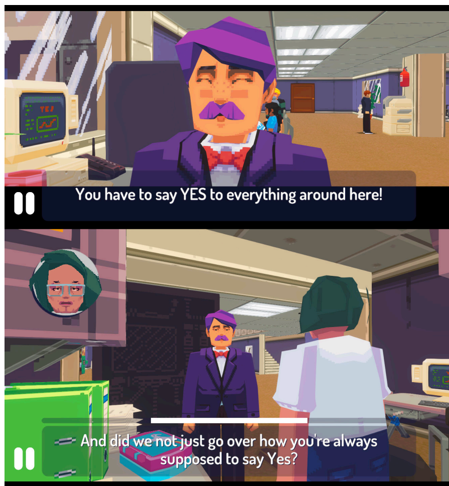
FIGURE 3 Screenshot from video game Say No! More by Studio Fizbin, 2021.

if your position is precarious you might not be able to afford no. You might say yes if you cannot afford to say no, which means you can say yes whilst disagreeing with something. This is why the less precarious might have a political obligation to say no on behalf of or alongside those who are more precarious (Ahmed 2017).