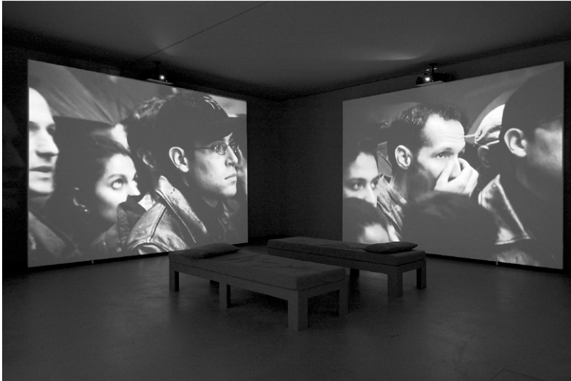
Broadway , Craigie Horsfield, © 2006. Courtesy of the artist.

in itself a temporality leading to an awareness of historical time, can in fact be (as is the case here) an exploration of presentness as a condition of the possibility of history.