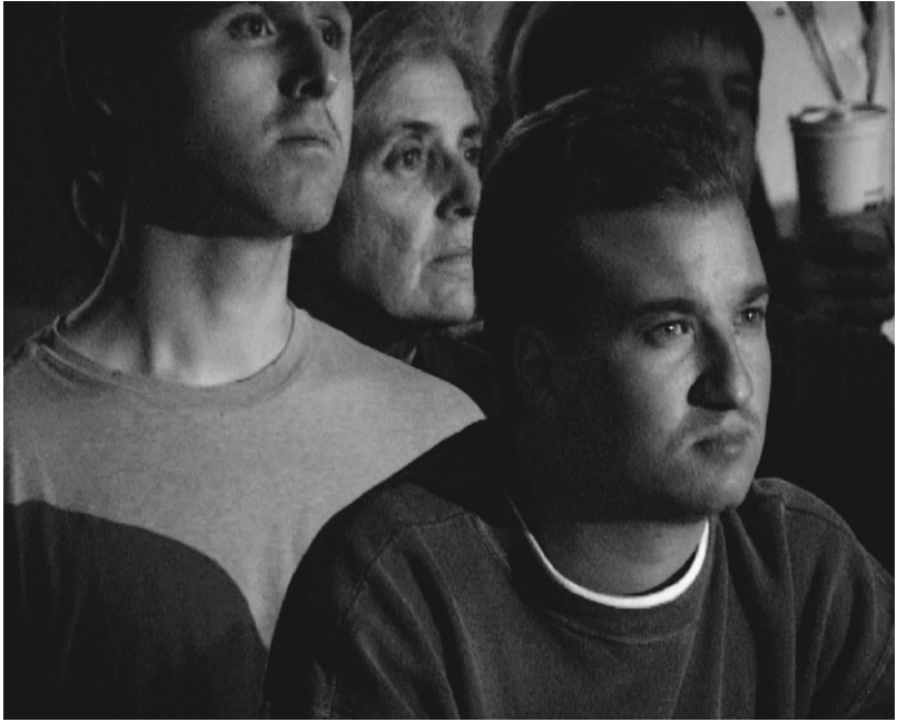
Broadway , Craigie Horsfield, © 2006. Courtesy of the artist.

disposed of as an obsolescence. They are presents themselves in that it is usually impossible to figure out which screen, in its imagery, anticipates, announces, follows or continues the other. Yet, from all these possible presents, a past present and a future present take shape.