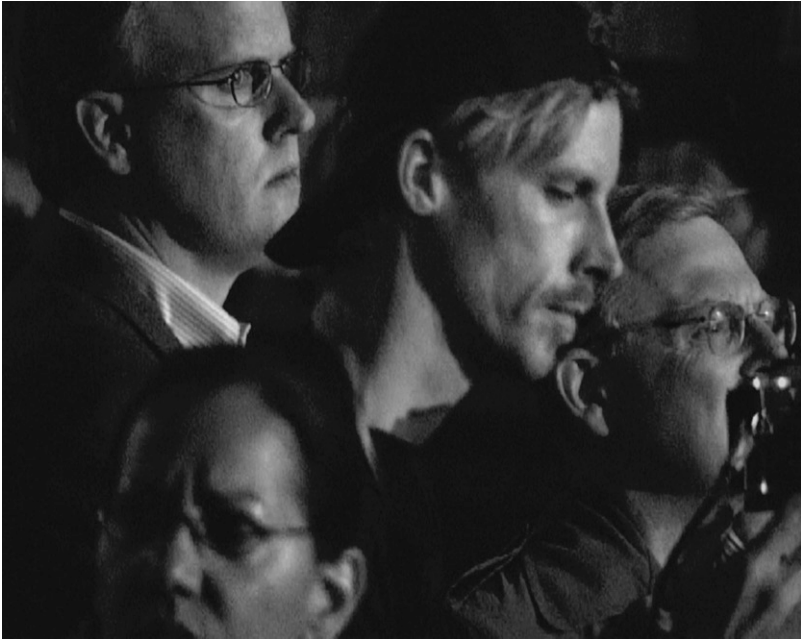
Broadway , Craigie Horsfield, © 2006. Courtesy of the artist.