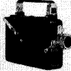
CINÉ-KODAK MAGAZINE 16

Three-second loading with interchangeable Kodachrome or Panchromatic film magazines; f/1.9 lens interchangeable with six accessory lenses, including a wide-angle lens and ranging out to a five-times telephoto; enclosed direct-view finder serves all lenses; four operating speeds including slow motion; unique footage-indicator control "doubles" as magazine release when changing film; pulsing button for gauging scene length; attached Universal Guide for all Ciné-Kodak Films.