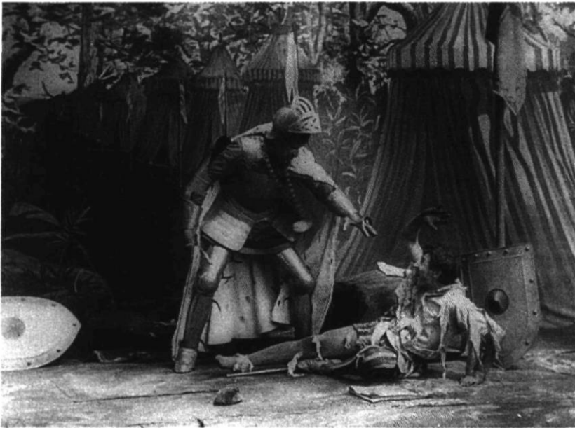
Francesca da Rimini de la Vitagraph Company (1908)

access to Lanciotto's subjectivity, while constructing him as a sympathetic character. In this case, the determinate operations of the text work in concert with a particular intertextual frame to produce a particular reading. But does specifying the intertextual conditions of production enable us totally to specify the intertextual conditions of reception? In other words, would the film's viewers have deployed the same intertextual frame as the film's producers? Probably not, which requires us to adduce further evidence, encompassing a full spectrum of intertexts from the restricted to the popular.