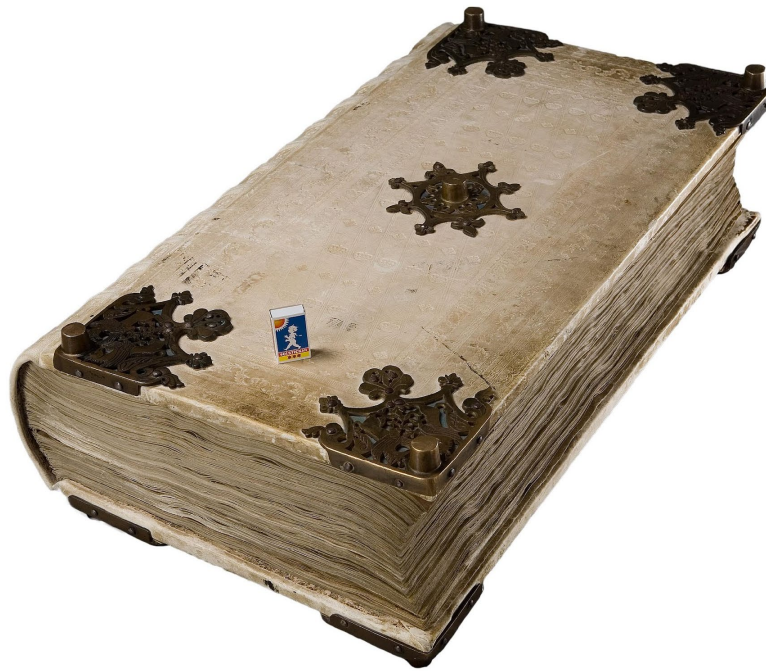
Figure 1. The Codex Gigas weighs 75 kilograms and has 310 parchment leaves, each of them 89 centimetres high and 49 centimetres wide. It is believed to be the world’s largest preserved medieval manuscript.

Thomas Vogler, another “mobilst,” claims that, “although the history of writing might have to include anything from the cave walls of Lascaux to ancient stelae ... our definition of the book must be narrowed to records in portable form.” 21 This assertion, with its attendant restrictions, yields no merit, given that the Lascaux cave paintings can certainly be viewed as Palaeolithic picture books due to the fact that a narrative is clearly being evoked. If we accept a definition of book art wherein “books that are themselves works of art, in which imagery, text, materials ... respond to cultural metaphors of the book,” 22 then the Lascaux cave paintings certainly conform to that definition. To put the implausibility of portability into a global perspective, Cai Guo-Qiang cites an example, from China, of a permanent natural feature that is considered a book