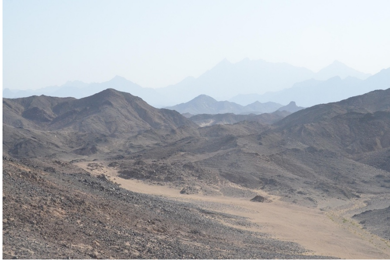
Figure 2. Eastern Desert, Egypt.

the Eastern Desert (the Red Sea Hills), a mountainous region with plentiful stone quarries (see figure 2).