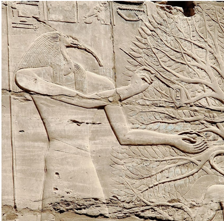
Figure 4. Thoth inscribing the cartouche of Seti I onto a leaf of the sacred išd tree and effectively onto the stone of the temple of Amun, in Karnak.