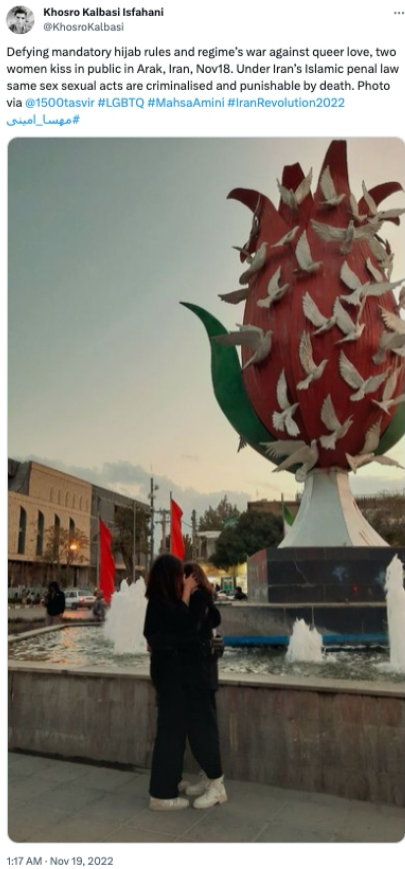
Figure 5. † Resistance against compulsory hijab regulations and the government’s crackdown on LGBTQ+ relationships, two women publicly share a kiss in Arak, Iran, in November 2020.