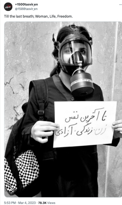
Figure 7. † Amidst a series of chemical attacks on girls’ schools, a student defiantly holds a sign reading, “Woman, Life, Freedom” Until My Last Breath.” March 4, 2023.