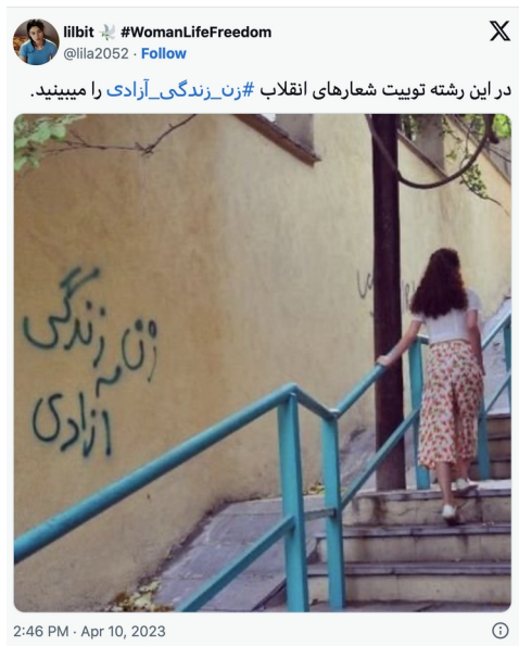
Figure 11. † Women, public space, and daily life. The writing on the wall reads: “Woman, Life, Freedom.”

In the words of W. E. B. Du Bois, a strike is “a wide basis against the conditions of work,” and the feminist strike in Iran showcases its all-encompassing basis against the conditions of living and the restrictions on freedom (1976, 67). In this light, the resounding slogan of “Jin, Jiyan, Azadi” acquires its profound significance, encapsulating the essence of their struggle.