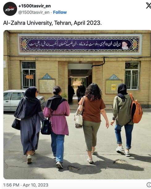
Figure 8. † Several university students entering Al Zahra University without mandatory hijab, Tehran, April 2023.