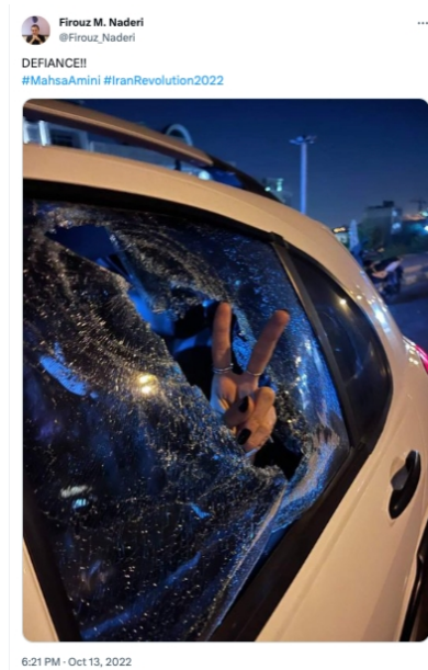
Figure 6. † “No Matter How Much You Try to Harm Me, I Will Not be Wounded; I Will Keep Sprouting.”