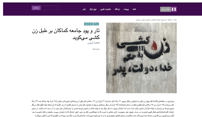
Figure 1: † Graffiti stating: "Femicide by The Law of God, State, And Father."

The political underpinning of veiling in Iran delineates a femicide machine within the authoritative Islamic regime. Mandatory veiling serves as the starting point for the subsequent control over women's bodies, agency, the exploitation of feminized labor, and the perpetuation of violence and feminized poverty. The mandatory act of veiling and the control over women's bodies function as crucial components within Iran's femicide machine, employed as an axis for the state's radicalization.