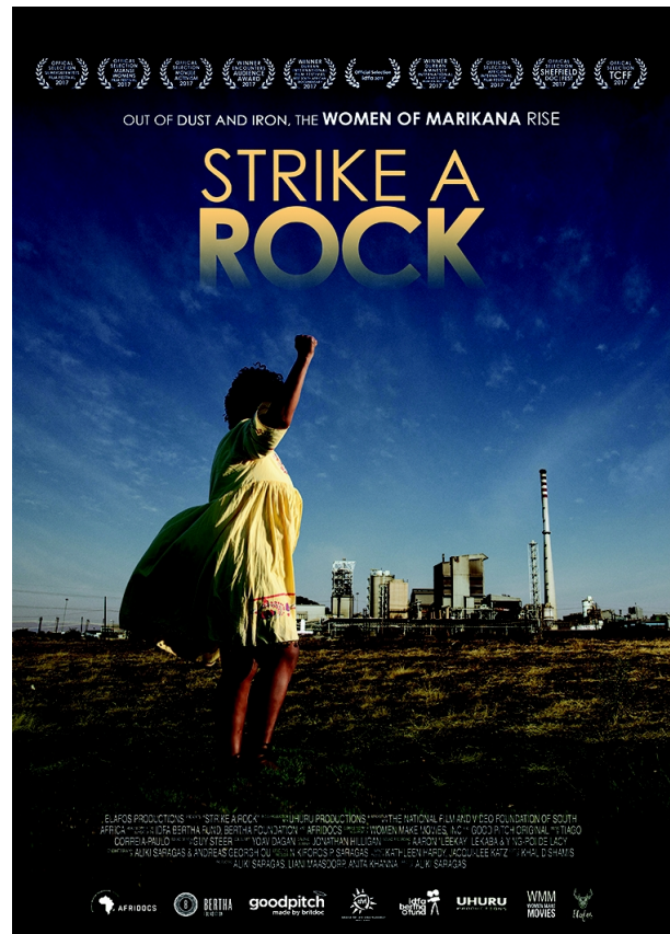
Figure 3: Poster for the film Strike a Rock . Director Aliko Saragas

involved a strong workers’ movement and internationalist accents during the 1980s.