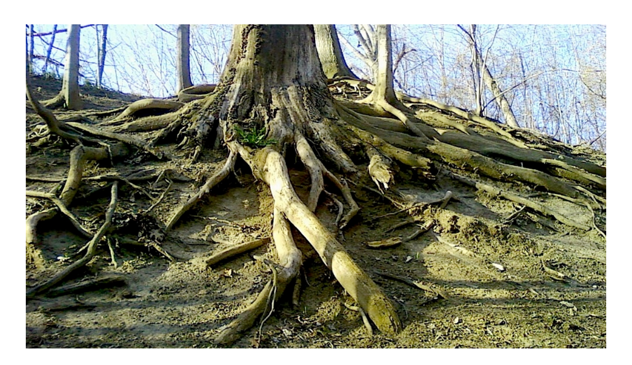
Figure 3 Dendro Series: Rizoma

This is an intricate and crucial question, I believe, and I am beckoned to explore it further. I respond by excavating another image.