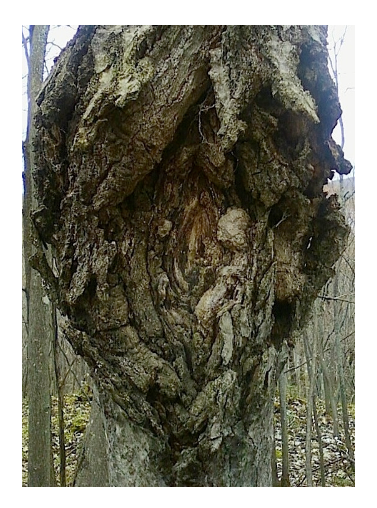
Figure 4 Dendro Series: On Burls