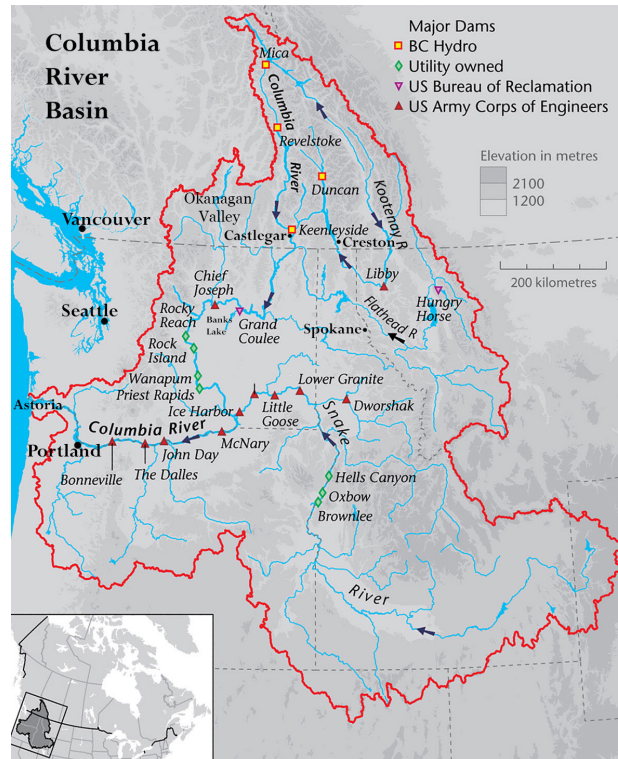
Figure 1: Columbia River Basin Dams.